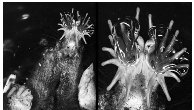
Fig. 3. The star-nosed mole's unique somatosensory organ, composed of 11 pairs of fleshy appendages for tactile perception. The image on the left features the star-nosed mole ( Condylura cristata ) in the midst of an underwater sniff, with bubbles being re-inhaled by the nose. The image on the right zooms in on the nose and the air bubble.

The star-nosed mole is recognized for its ornate soma-