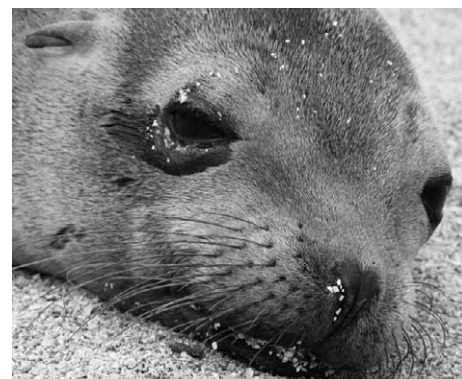
Fig. 1. A close-up picture of a sea lion ( Zalophus wollebaeki ) reveals a dense matrix of vibrissae. These tactile end-organs function to detect particles and vortices in the underwater environment.

Qualitative differences between the whiskers of sea lions and seals may explain variations in the animals' performance. Miersch et al. (2011) isolated single whiskers of both animals and tested the whiskers' response to underwater wakes. For both types of whiskers the researchers cal-