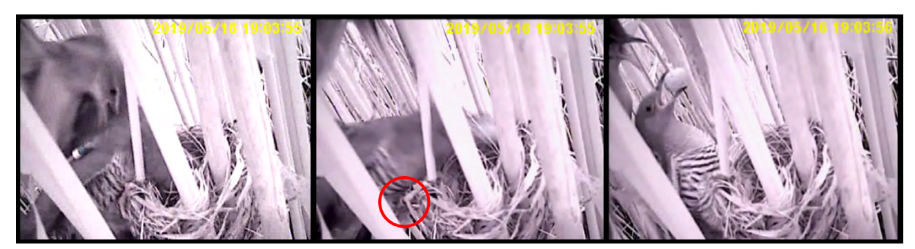
Fig. 2. Screenshots from the video-recording in which a female common cuckoo was knocked down from the nest by the great reed warbler female. The nest contained three host eggs and the cuckoo removed one of them during the attacks by the host female. The female cuckoo did not lay her own egg. The second frame shows that the cuckoo had a ring on her right tarsus (in the red circle). For the whole video, see supplementary online material.