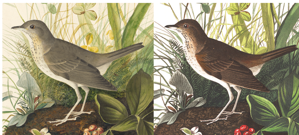
Figure 5. Comparison of cropped images of Tawny Thrush T. Wilsonii (= T. mustelinus Wilson) in Audubon's original painting (left) and Pl. 164 of The birds of America (right). The original painting (N-YHS no. 1863.17.164) was executed with watercolour, graphite, gouache, black ink, black chalk, pastel, and selective glazing on paper, laid on card. It is reproduced here courtesy of the New-York Historical Society; digital image created by Oppenheimer Editions. The image in Pl. 143 was engraved by Robert Havell Jr. in 1833, with the original painting as a reference, and then hand-coloured by a team of colorists. Reproduced courtesy of the John James Audubon Center at Mill Grove in Audubon, PA, and the Montgomery County Audubon Collection.