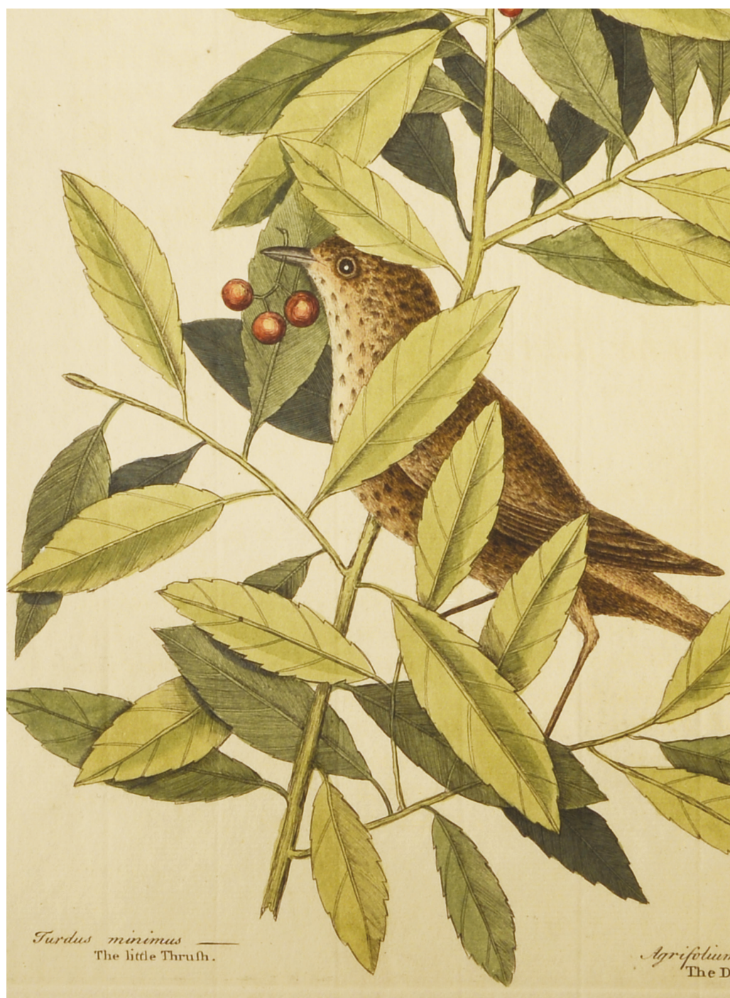
Figure 1. Cropped image of Little Thrush from Pl. 31 of Catesby (1731), probably illustrated without reference to a specimen (see text).