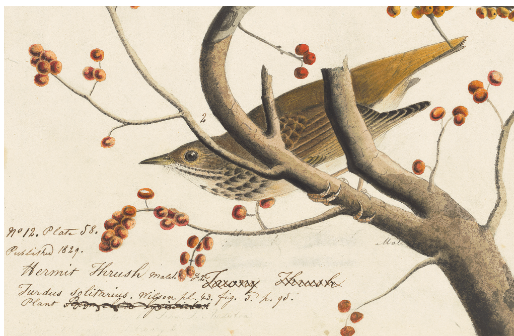
Figure 6. Cropped image of Audubon's original painting of Hermit Thrush T. solitarius (= Catharus guttatus faxoni), showing his mistaken identification ('Tawny Thrush,' crossed out). The painting was executed with watercolour, graphite, pastel, black ink and gouache on paper, laid on card (N-YHS no. 1863.17.58). The inscription in the lower left reads: 'No 12. Plate 58. / Published 1829. / Hermit Thrush Male 1. F. 2. Tawny Thrush [crossed out] / Turdus solitarius. Wilson pl. 43. fig. 3. p. 95. / Plant Bromelia lycis... [crossed out]'. The painting was signed below in graphite: 'John. J. Audubon.'

as Audubon claimed. But the breeding range of Hermit Thrush extends all the way to far eastern Labrador, matching Audubon's description of Tawny Thrush range. This discrepancy supports the hypothesis that when Audubon heard Hermit Thrushes ( C. g. faxoni ) sing in the distance, he incorrectly identified them as Tawny Thrushes; recall, he thought Hermit Thrush was mute (Audubon 1831: 303). Audubon's original painting of Hermit Thrush (N-YHS no. 1863.17.58) provides further evidence that he confused these species: below the image, Audubon initially labelled his illustration 'Tawny Thrush,' but sometime later crossed it out and wrote 'Hermit Thrush' (Fig. 6).