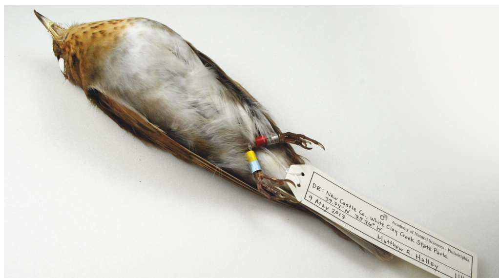
Figure 7. ANSP 204310, the neotype of Turdus mustelinus Wilson (= Catharus f. fuscescens ), see text for detail of the specimen's provenance (Matthew R. Halley)

Art. 72.7 of the Code (ICZN 1999). It is not, however, unambiguously identifiable because none of its type material is extant or traceable, and the attributes described in the original description of T. mustelinus Wilson are shared by more than one species. To fix the taxonomic identity of Turdus fuscescens Stephens, 1817, so that traditional nomenclature is maintained and to prevent destabilising confusion arising from alternative identifications, I hereby designate as its neotype ANSP 204310, a colour-banded male deposited in the collection of the Academy of Natural Sciences of Drexel University, Philadelphia. This action fulfills the requirements for neotype designation in the Code (ICZN 1999) by: clarifying the taxonomic application (status) of the name, as explained above (Art. 75.3.1), describing, illustrating and referencing the defining characters of Veery and its neotype (Art. 35.3.2), providing data sufficient to ensure recognition of the specimen designated (Art. 75.3.3), providing grounds for believing that all original type material has been lost and is untraceable (Art. 75.3.4), showing that traits of the neotype are included in the original description (Art. 75.3.5), choosing the neotype from a locality in the same physiographic province (second-growth Mid-Atlantic Piedmont forest) where Wilson collected some of his type material (Art. 75.3.6), and recording that the neotype is preserved as the property of a recognised scientific institution (Art. 75.3.7).