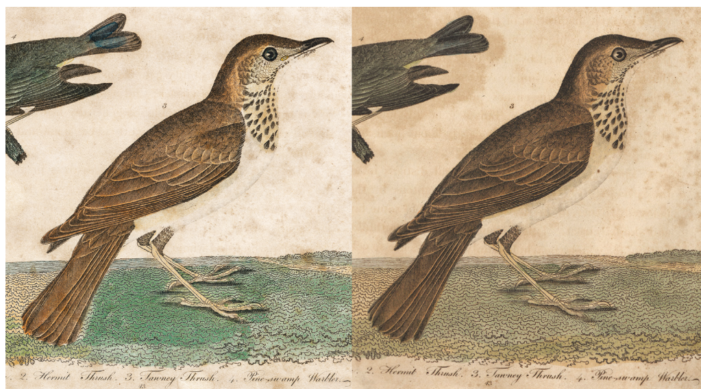
Figure 4. Comparison of cropped images of Tawny Thrush T. mustelinus Wilson, in two different original pressings of American ornithology , vol. 5, Pl. 43 (1812). The image on left is from Bartram's personal copy, given to him by Wilson and now stored in the library at Bartram's Garden in Philadelphia. It is noticeably dirtier than other plates from the same volume (J. Fry pers. comm.). The image on right, reproduced from a copy of uncertain provenance in the Library of the Academy of Natural Sciences of Drexel University (QL681. W732), is even more discoloured.

(Fig. 4). However, neither the plates, nor the unpublished watercolour and pencil drawing that served as their basis (see Burt & Davis 2013 for a reproduction), bring clarity to the problem that dorsal coloration is shared by more than one species.