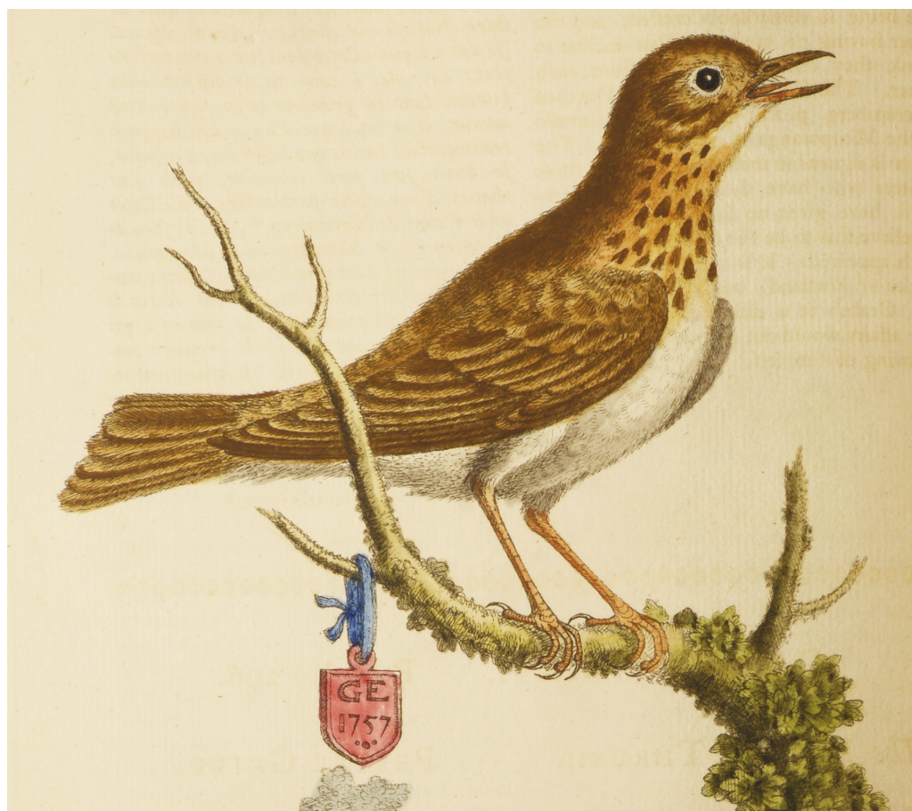
Figure 2. Cropped image of Little Thrush from Pl. 296 of Edwards (1760), depicting the specimen collected in 1756 by William Bartram (see text). A medallion in the illustration bears the initials 'GE' (George Edwards) and the year 1757, indicating that the image was drawn from a fresh specimen, not more than one year old.

lists sent by Catesby to Hans Sloane in May 1723 and March 1724 (see Nelson 2017). Nevertheless, his descriptive text provides useful clues to its identity: