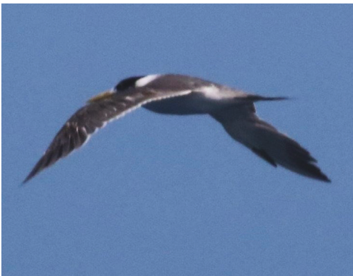
Figure 5. Swift Tern Thalasseus bergii , off Tofo, Inhambane Province, Mozambique, 29 August 2016, possibly of the race velox , showing relatively dark upperwings of a grey tone similar to Lesser Black-backed Gull L. fuscus

T. b. thalassinus breeds on coasts of Tanzania and Kenya, and has much paler upperparts than T. b. bergii , with the grey tone equivalent to Lesser Crested Tern T. bengalensis (see Stevenson & Fanshawe 2002). It is smallest in wing and bill lengths (Table 3) of the first three taxa discussed here. This race has not been confirmed to occur in Mozambique, but it appears probable that T. b. thalassinus is present in at least the northern coastal provinces (see below).