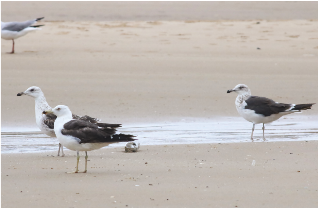
Figure 4. Three Lesser Black-backed Gulls Larus fuscus , Maputo, Mozambique, 16 January 2016, all showing characters of nominate fuscus (Baltic Gull), second-calendar year (left back, partially obscured), subadult (middle) and fourth-calendar year (right)

Sources: 1 Brooke et al. (1981) (indicated as 'x' where no counts provided) and Parker (2005); 2 SABAP database; 3 Parker (1999); 4 this study (record in brackets from Bazaruto archipelago).