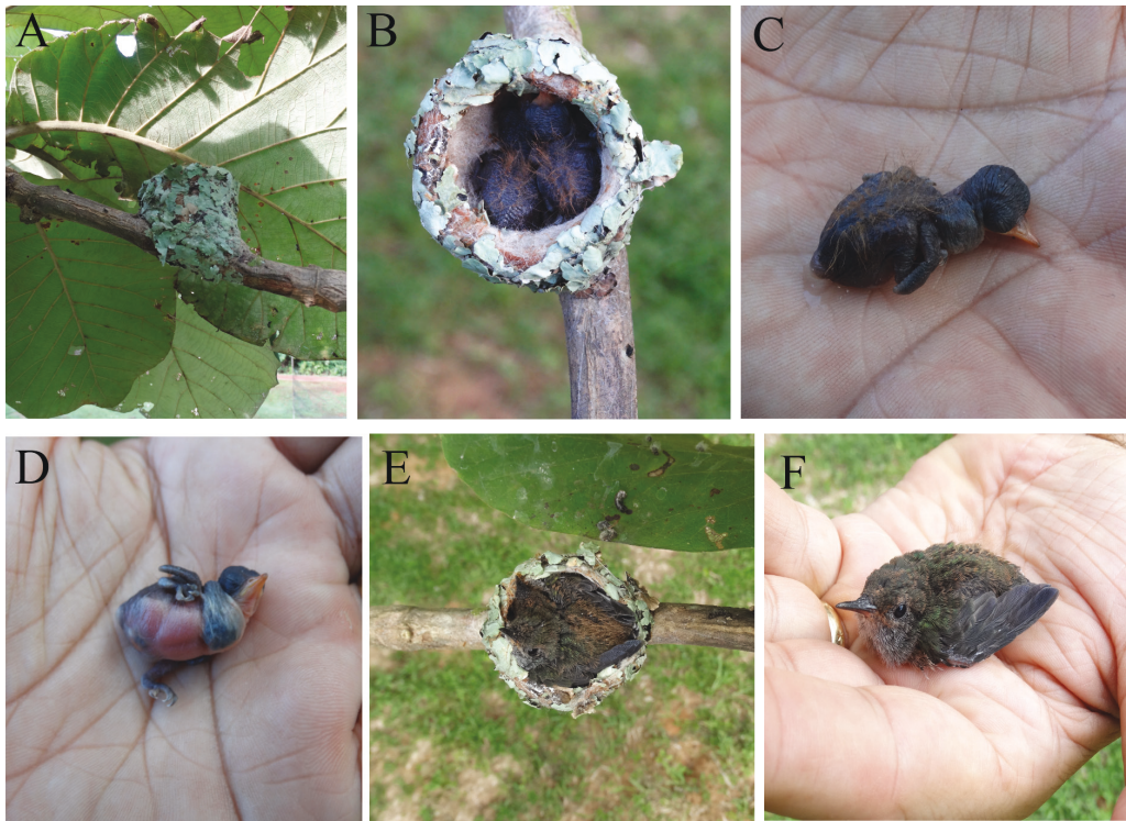
Figure 2. Nest of Sapphire-spangled Emerald Amazilia lactea bartletti with two nestlings on a horizontal branch of Tectona grandis : (A) outer nest wall showing lichen ornamentation; (B) dorsal view of nest with recently hatched nestlings (2–3 days old); (C–D) dorsal and ventral views of a nestling on the day it was found (23 March 2017); (E) feathered nestlings on 30 March 2017; (F) nestling on the day it was banded (4 April 2017) (Edson Guilherme)