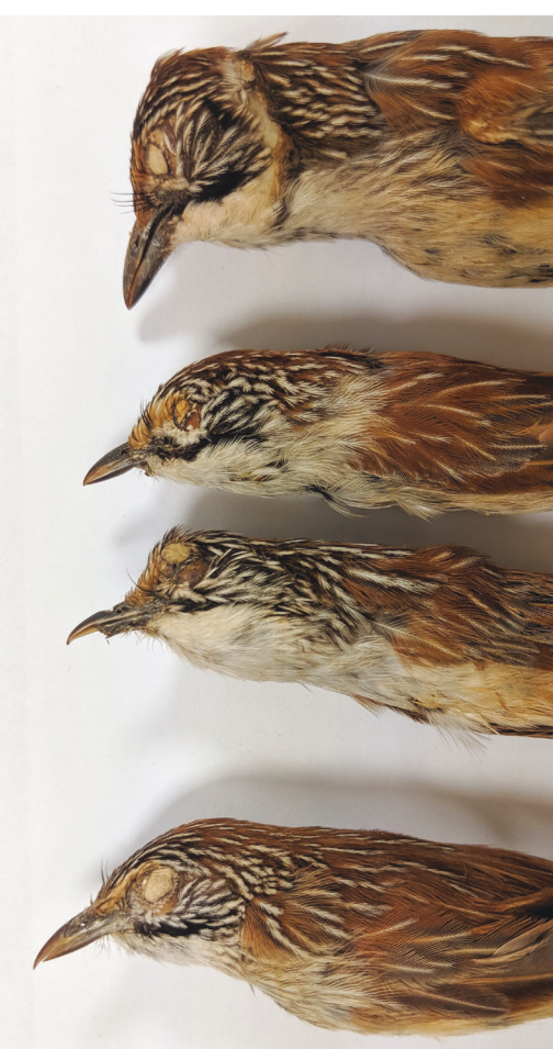
Figure 6. Bill profiles of the same specimens as in Fig. 5, from above in reverse order; A. w. whitei female AMNH 598127; A. whitei (Cape Range) female AMNH 598126; A. whitei (Cape Range) male AMNH 598125; A. w. oweni male AMNH 598115; note the small size and diminutive bills of the Cape Range specimens (B. Bird)

Type locality, distribution and habitat. —Carter observed grasswrens only twice, and ‘at the same locality – viz., a rocky kopje’ (Carter 1903: 37) ‘on the table-land lying behind the ranges [inland from] the Yardie [Creek]’ (Carter 1902: 84), i.e. towards the southern extremity of the range. He described the Cape Range plateau as ‘broken table-land, mostly very rugged, with much spinifex, [where] in one place a few cabbage-tree palms occur, which is somewhat remarkable’ (Carter 1903: 31). Those relict palms Livistona alfredii occur at just one locality on the Cape Range (c.22°23’S, 113°54’E), 280 km or more from the nearest populations in the Pilbara (Humphreys et al. 1990), and rocky outcrops, perhaps Carter’s ‘kopjes’, are prominent nearby (SRM pers. obs.). We infer that grasswrens are restricted to the limestone plateau of Cape Range and perhaps only to its undissected southern portion. They are isolated from the nominate subspecies by 160 km of lowlands without suitable habitat (R. E. Johnstone pers. comm.). Carter (1903:37) described the type locality as having ‘low scrub and patches of spinifex round [sic]’ with bare patches and emergents, such as ‘a [native] fig tree’ ( Ficus sp.). In contrast, G. Lodge (pers. comm. per R. E. Johnstone) observed a pair in spinifex on sand hills at the top of the range in the 1980s. The Cape Range is broadly