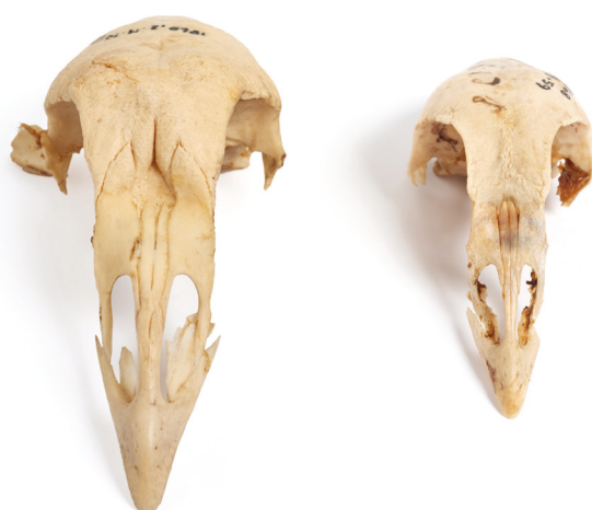
Figure 9. Dorsal view of a Cochin skull NHMUK 1868.2.19.70, left, showing a deep groove along the middle of the frontal bone, compared with Red Junglefowl G. gallus skull NHMUK 1868.2.19.59, right, showing the flat surface to the frontal bone