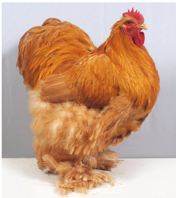
Figure 7. Buff Cochin cock; the Cochin, first introduced into Britain in 1847, does not originate from Cochinchina (Vietnam) but from China and is kept purely for exhibition. The Cochin is in many aspects very different from other breeds but, according to Darwin (1868: 260), 'All the characteristic differences of the Cochin breed are more or less variable and may be detected in greater or lesser degree in other [Chinese] breeds'