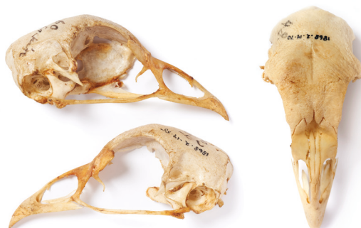
Figure 8A–B. Two Cochin skulls from Darwin's collection, right a male, NHMUK 1868.2.19.70 (Darwin's no. 48) and left a hen, NHMUK 1868.2.19.55 (Darwin's no. 60). Sectioning of the hen's skull was performed by (or for) Darwin, as it was needed for a picture on p. 263 in Variation under domestication, 1868, vol. 1 (see Fig. 8B), wherein it is stated that the skull is of a male