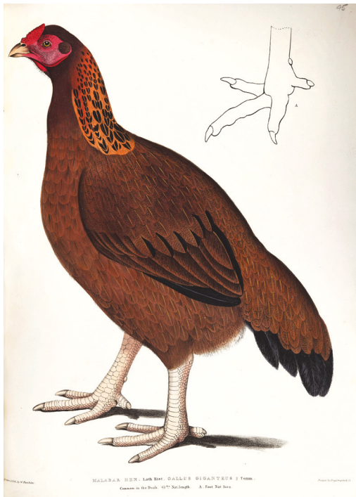
Figure 3. Pl. 45, Malabar hen Gallus giganteus , by Benjamin Waterhouse Hawkins in Gray & Hardwicke's Illustrations of Indian zoology