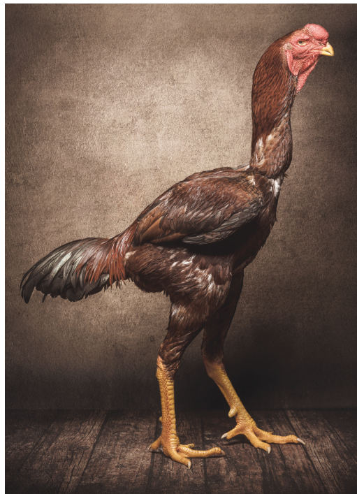
Figure 4. Black-breasted Red Malay cock, one of the tallest breeds of chicken, originally bred for cockfighting but nowadays for exhibition alone

the same as Temminck's G. giganteus . The birds pictured resemble the Aseel, an Indian breed used for cockfighting (see Appendix 2).