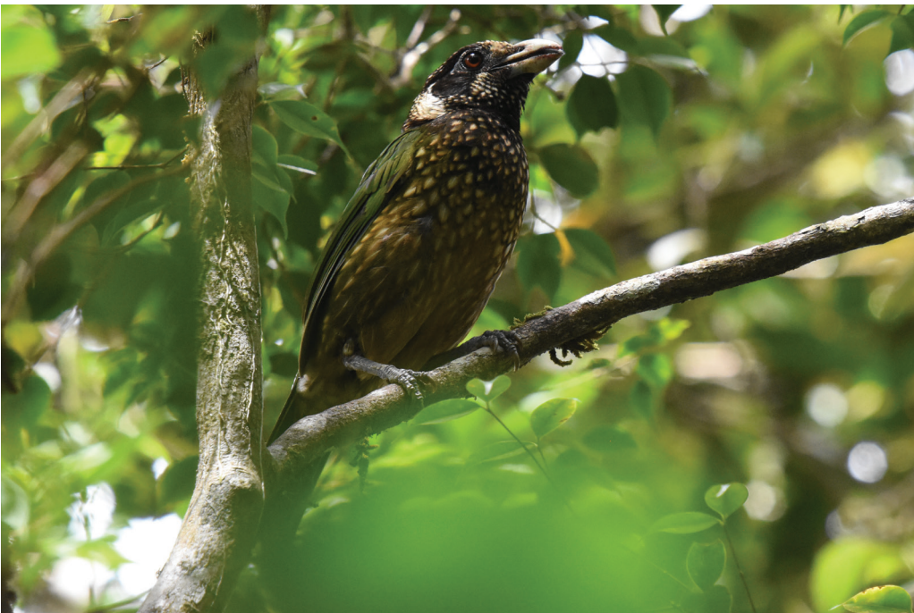
Figure 2. Black-eared Catbird Ailuroedus melanotis , Yapen Island, New Guinea, 8 September 2020 (Brecht Verhelst)