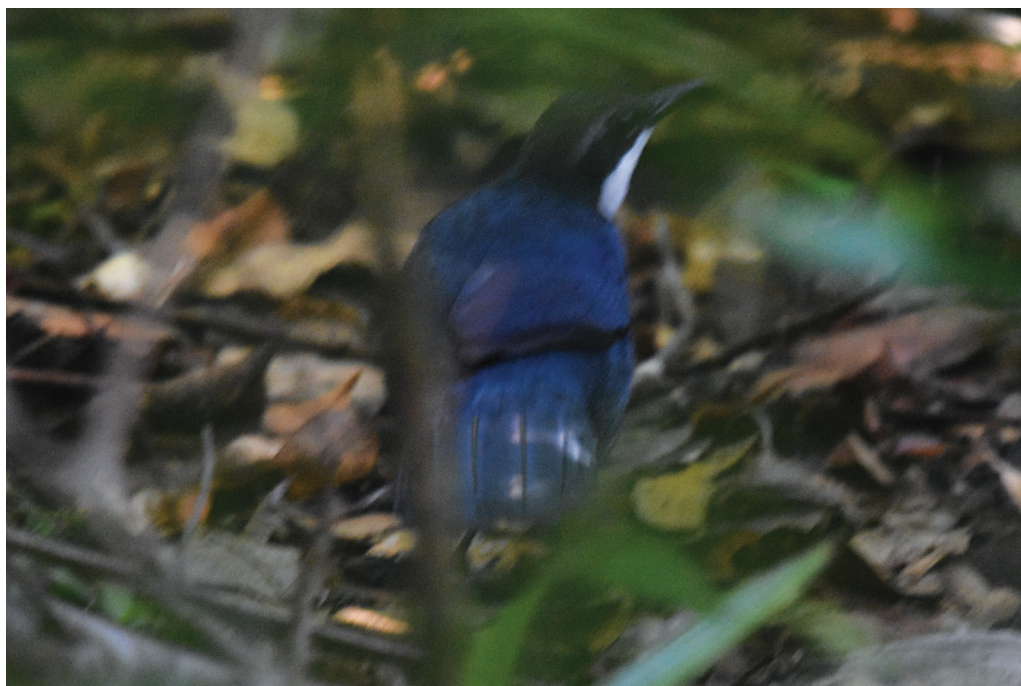
Figure 3. Presumed male Dimorphic Jewel-babbler Ptilorrhoa cf. geislerorum , Yapen Island, New Guinea, 9 September 2020 (Brecht Verhelst)