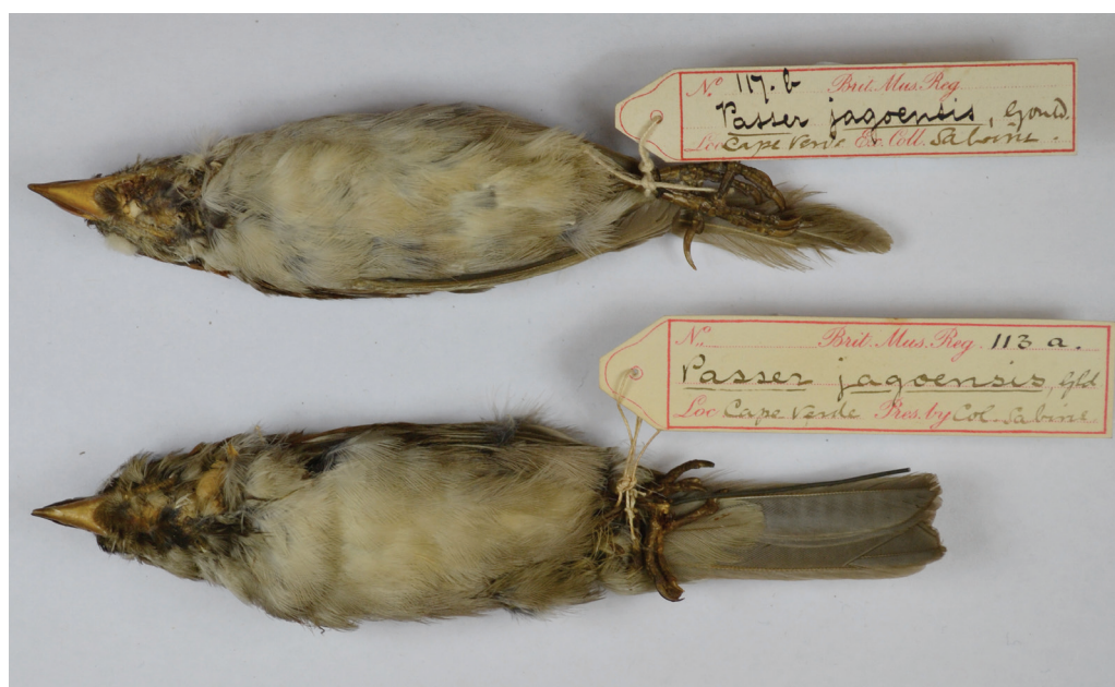
Figure 3. Two Cape Verde Sparrow Passer iagoensis specimens collected by Edward Sabine in January 1822 on Santiago, Cape Verde Islands. Note that neither has an original label, but only a BM one dating from the late 1800s, and that '117b' on one of them is an error for '113b', its correct Vellum Catalogue number

arrived in the museum therefore is unclear, although it was almost certainly prior to 1837, when modern registration of incoming specimens commenced (Thomas 2012).