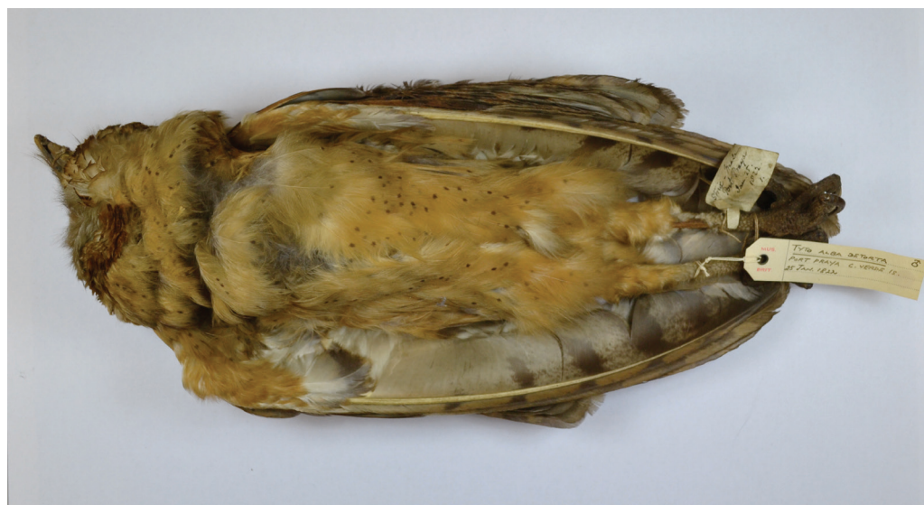
Figure 1. The early Barn Owl Tyto alba detorta specimen from Santiago, Cape Verde Islands

This all tends to indicate that Sharpe's ascription of the specimen to Darwin was incorrect. Another suggestion was later made by Hazevoet (1995: 75) who, in mentioning a few early Cape Verde specimens with uncertain collector(s) in NHMUK, commented