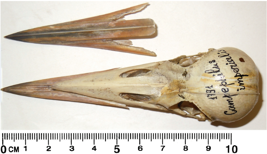
Figure 3. The ZISP skull (ZISP 1791), supposedly of Imperial Woodpecker Campephilus imperialis but actually Ivory-billed Woodpecker C. principalis , in dorsal view

American Museum of Natural History, New York (AMNH), United States National Museum, Smithsonian Institution, Washington DC (USNM), Museum of Comparative Zoology, Harvard University, Cambridge, MA (MCZ), and ZISP. All responded, and MCZ