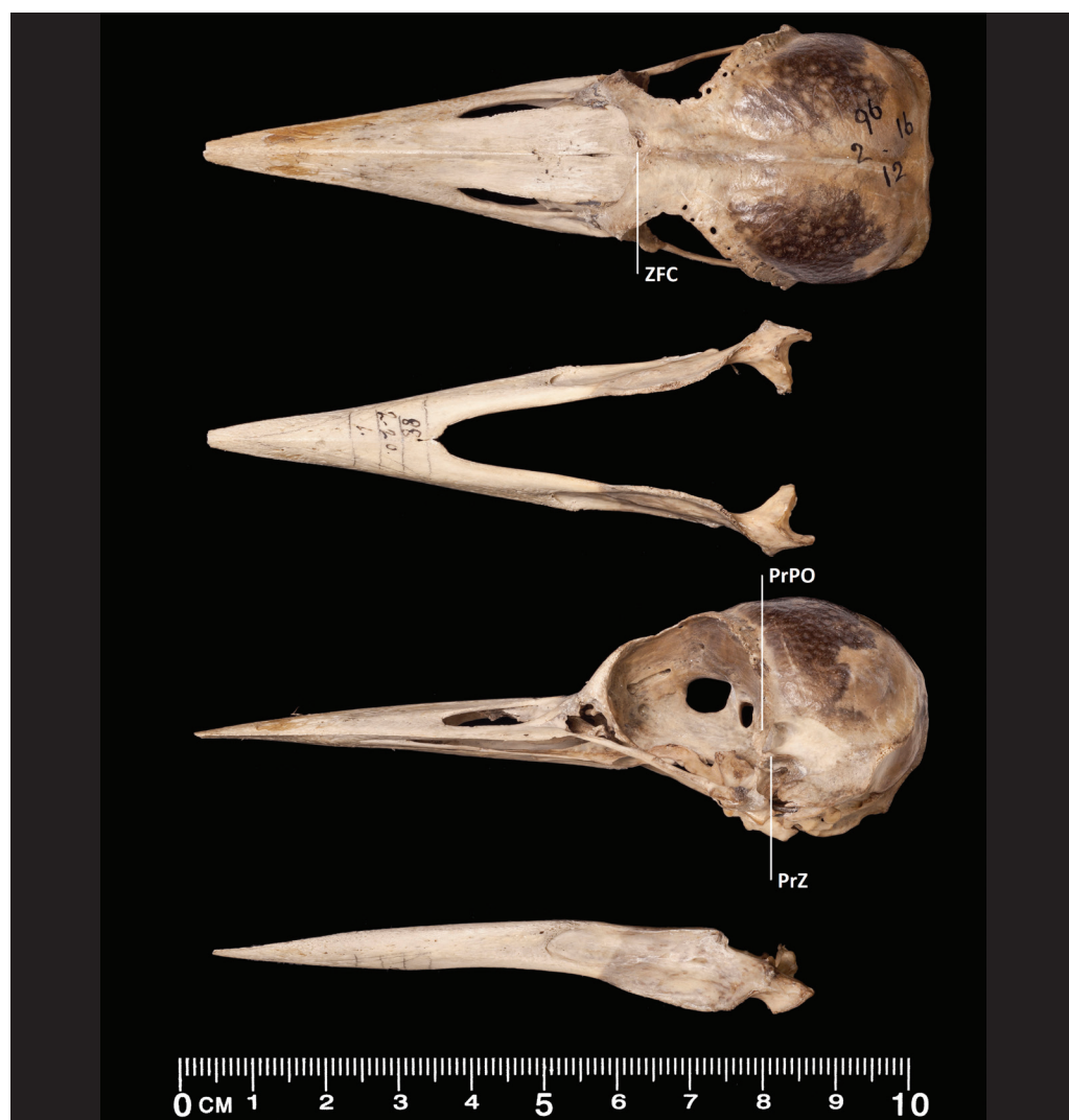
Figure 1. Skull of the unidentified NHMUK skeleton in dorsal and lateral views. ZFC: craniofacial flexion zone; PrPO: proc. postorbitalis; PrZ: proc. zygomaticus

presence of a ramphotheca increases skull length by on average 17.28% (range 16.2–18.0%, n = 4 ). As the skull without ramphotheca of the unidentified NHMUK skeleton measured 105.3 mm, this indicated that with its ramphotheca it would have had a total skull length of c.123.5 mm. Using these results, a plot of maximum skull width against skull length with ramphotheca clearly indicated that the unidentified NHMUK skeleton must be either a small individual of C. imperialis or a large C. principalis (Fig. 2).