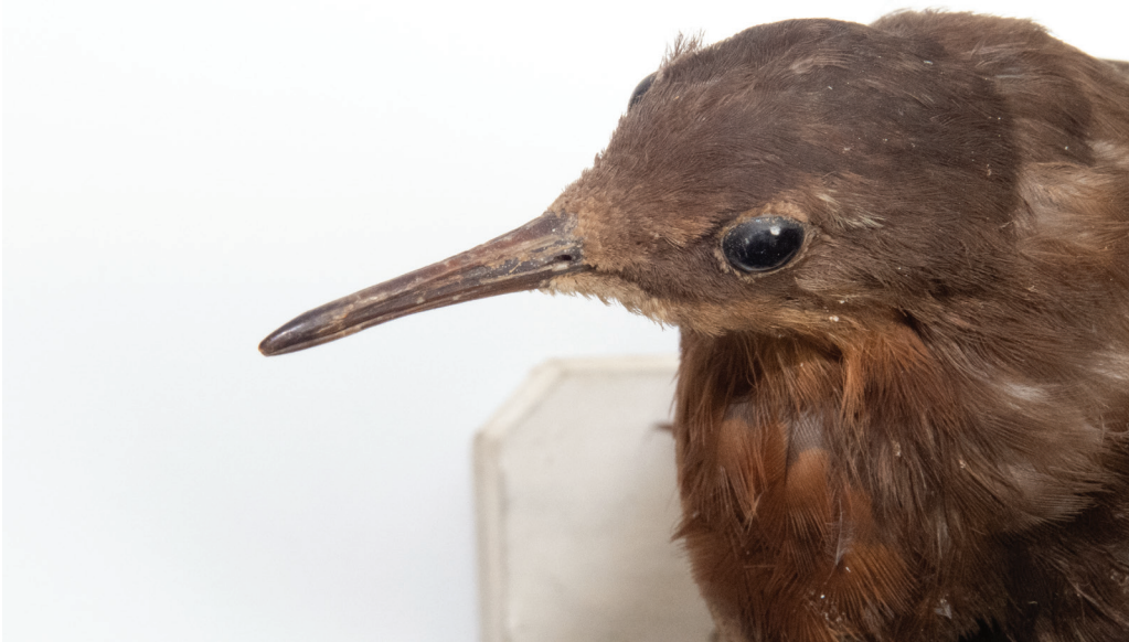
Figure 3. Tahiti Sandpiper Prosobonia leucoptera , RMNH.AVES.87556; note the minimal supercilium in this species, and the pale bill base