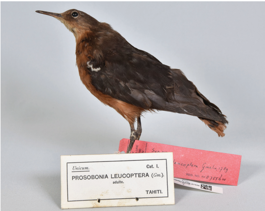
Figure 4. Tahiti Sandpiper Prosobonia leucoptera , RMNH.AVES.87556; note the pale head compared to Fig. 1