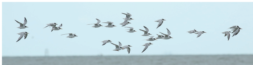
Figure 4. Little Terns Sternula a. albifrons were common on pelagic trips off southern Mozambique, October–April, but infrequent and occurred in small numbers onshore except at a small number of undisturbed roost sites, or in bad weather. Maputo Bay, Mozambique, 23 February 2016 (Callan Cohen)

Recent records in Mozambique. —In nine years of observations in southern Mozambique Little / Saunders's Terns were recorded in every month (2010–19; GA pers. obs.), but positive identifications were determined only for birds in breeding plumage. There were a small number of positively identified Little Terns in late September and more as they attained breeding plumage in February–April. No field observations of birds in the period October–January were considered identifiable to species and they were treated as Little / Saunders's but all photographs were re-examined in light of Mullarney & Campbell (2020) and all those identifiable were Little. The majority of non-breeding plumage birds were probably Little rather than Saunders's Terns. Where subspecific identification was possible, all were S. a. albifrons and sinensis was not suspected.