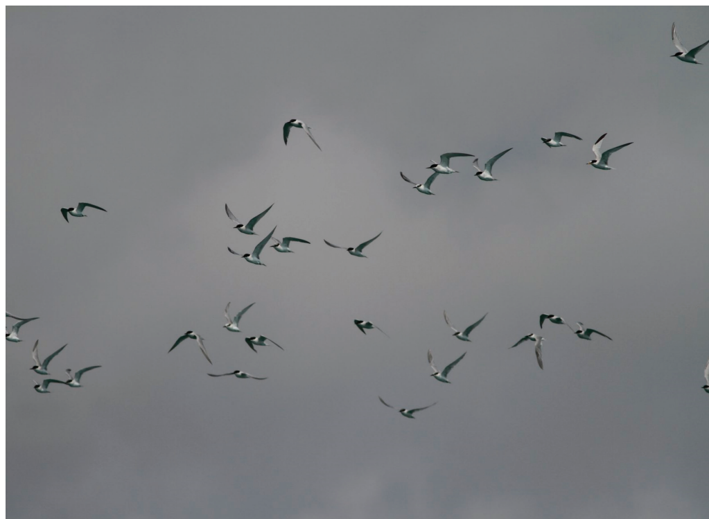
Figure 3. Part of a flock of Damara Terns Sternula balaenarum , including one Saunders's Tern S. saundersi and four Sternula spp., San Sebastian, Mozambique, 30 October 2019

On 2 September 2019 CR found 29 Damara Terns in breeding plumage at Rattray's Point, and DG observed 17+ there on 15 September. With increasing observer interest, larger numbers were found, all loafing on the same area of sandbanks, including 75 on 18 September and a max. 100+ on 24–28 October. Numbers then quickly declined to single figures by mid November. In 2020 none was seen in two visits in February, but 15–25 were recorded in May–July. In 2021 none was seen in January, but 80 in May and 106 in August (Appendix 1).