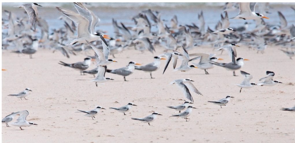
Figure 7. Part of a group of at least 26 Saunders's Terns Sternula saundersi , Rattray's Point, San Sebastian Peninsula, Mozambique, 31 December 2018; non-breeding birds identified using criteria developed by Mullarney & Campbell (2022) for separation from Little Tern S. albigrons . The head pattern shows a narrow black line behind the eye with a pure white rear crown and lacks a white 'notch' or hint of eyestripe above the eye, the mantle is pale grey and wings tricoloured, with white secondaries and a contrasting dark carpal bar (Christine Read)