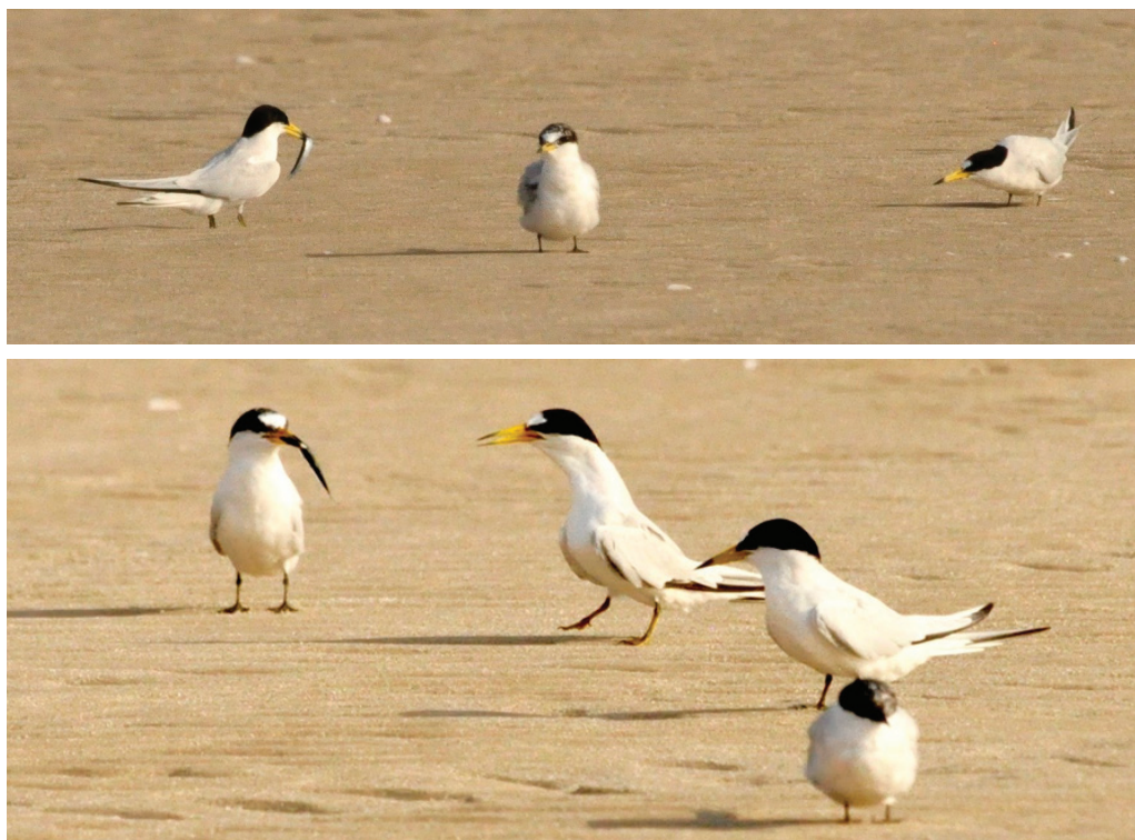
Figure 6. Courtship-feeding by Saunders's Terns Sternula saundersi , San Sebastian Peninsula, Mozambique, 2 September 2019. A. (top) male (left) 'parading', carrying food while female (right) adopts receptive hunched posture. B. (lower) both birds in 'erect posture' after fish presented, with head up and carpal joints free from body in male; note Damara Tern S. balaenarum in foreground (Christine Read)