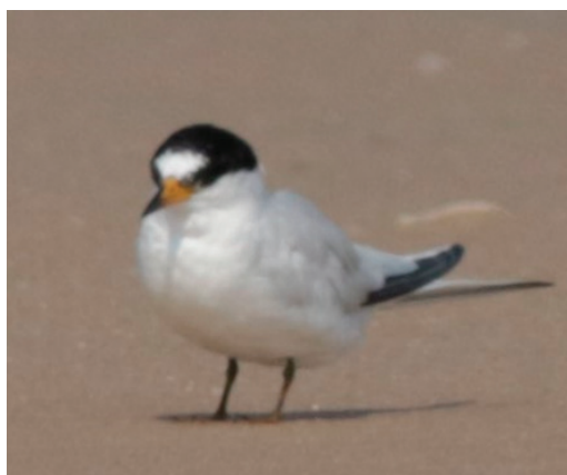
Figure 5. Saunders's Tern Sternula saundersi , Rattray's Point, San Sebastian Peninsula, Mozambique, 6 August 2018; first record for Mozambique and southern Africa. Note square-cut white forehead not extending above eye, at least three dark outer primaries and contrastingly pale, pearly-washed mantle (vs. blue lead-grey in Little Tern) and dull-coloured legs (Gary Allport)

Based on Little Terns (Cramp 1985), the behaviours observed in September 2019 were interpreted as at least one pair in courtship with a male carrying fish, 'parading', and a female adopting a receptive 'hunched' posture (Fig. 6A) followed, after presentation of the fish, by 'erect-posture' by both birds (Fig. 6B). This type of courtship-feeding is thought to establish and maintain pair bonds and is normally a pre-requisite to successful copulation, but the behavioural sequence observed in Little Terns prior to copulation is different from courtship-feeding (Cramp 1985) and we did not observe attempted copulation by Saunders's Terns.