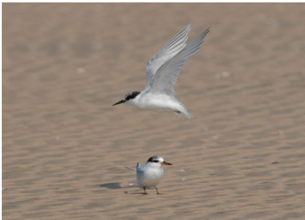
Figure 1. Damara Tern Sterna balaenarum (above) and Saunders's Tern S. saundersi (below; this individual identified from other images), Rattray's Point, San Sebastian Peninsula, Mozambique, 6 August 2018; note fine-tipped all-dark bill, grizzled crown, forehead and above eye, and relatively pale outer primaries of Damara Tern (Gary Allport)