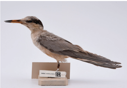
Figure 10. Little Tern Sternula a. albifrons collected at ‘Port Natal’ (now Durban), South Africa. Mentioned by Schlegel (1863) but no date of collection given. Cited by Saunders & Salvin (1896) as evidence of saundersi occurring in South Africa but lack of black outer primaries and darker grey inner upperwing show this to be a Little Tern (© Naturalis Biodiversity Centre, Leiden)

Naturalis specimen. —Photographed by staff at Naturalis (Fig. 10). There is no collection date, but it appears to be an adult, probably attaining breeding plumage with all-fresh primaries (so had probably recently completed wing moult), and partial breeding head pattern and bill coloration. From these characters, the collecting date is estimated to have been mid February to early April. It has dark primary shafts on the upperside but no clearly darker outer primaries, therefore supporting G. F. Mees’ conclusion that this a Little Tern of the nominate race.