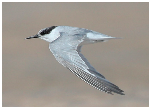
Figure 9. Damara Tern Sternula balaenarum , San Sebastian Peninsula, Mozambique, 9 May 2021. An adult in non-breeding plumage illustrating the dark primary wedge that can be shown in advanced primary moult. The otherwise monotone upperwing, with an ill-defined carpal bar, separates it from Little S. albifrons and Saunders's Terns S. saundersi in similar plumages; note also pale primary shafts (Niall Perrins)

The findings reported here suggest that Damara Tern may occur in the Indian Ocean, conceivably even as far north as Somalia, in April–September, presenting a new identification challenge in the Indian Ocean. Little Terns should be present in small numbers in the region at this time, but these may be second-calendar-year birds in faded, non-breeding plumage, and probably in active moult. Damara Tern is in non-breeding plumage until at least early September and whilst notionally straightforward to separate from Little / Saunders's Terns by the uniform pearl-grey upperparts, fine-tipped black bill and shorter-legged appearance at rest (pers. obs.), these characters are only diagnostic with good views and in direct comparison. A uniform outer wing and lack of contrasting darker outer primaries is a good feature in freshly moulted Damara Terns, but care is needed as birds in post-breeding primary moult can develop a very similar outer wing pattern to Little / Saunders's Terns, since their older outer primaries darken with age and contrast with the growing inner feathers (Fig. 9). Damara Tern tends to have a dusky, ill-defined carpal bar in fresh non-breeding plumage (Hockey et al. 2005) but this fades to leave a more uniform overall tone to the upperwing (pers. obs.). Clear white primary shafts and pale legs are additional features in good views. As yet, there is no good illustration of Damara Tern in non-breeding plumage, the most accurate being in Borrow & Demey (2014).