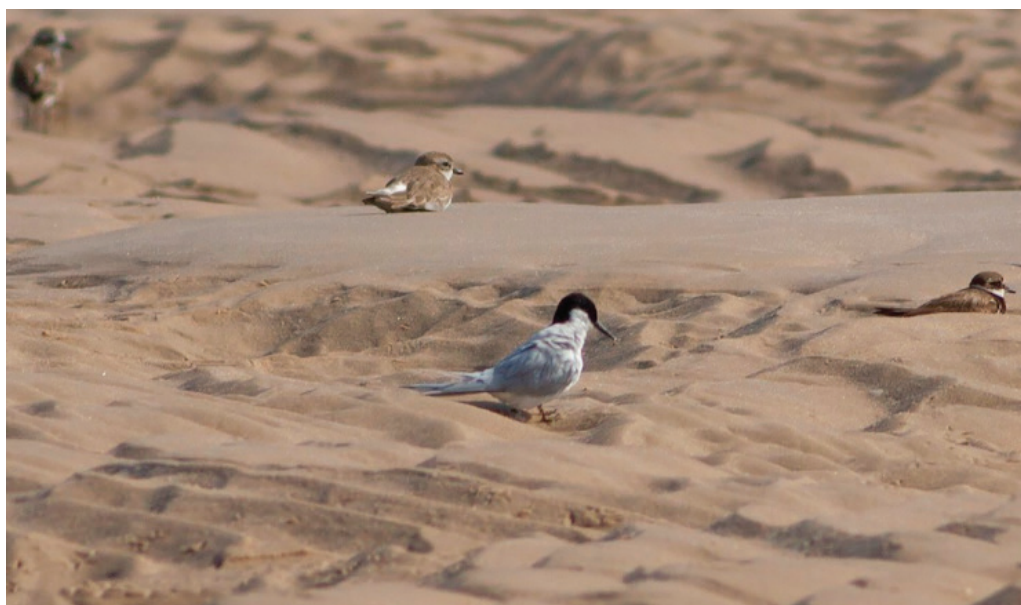
Figure 2. Damara Tern Sternula balaenarum , Rattray's Point, San Sebastian Peninsula, Mozambique, 28 September 2018; diagnostic all-dark cap and nape in breeding plumage (David Gilroy)