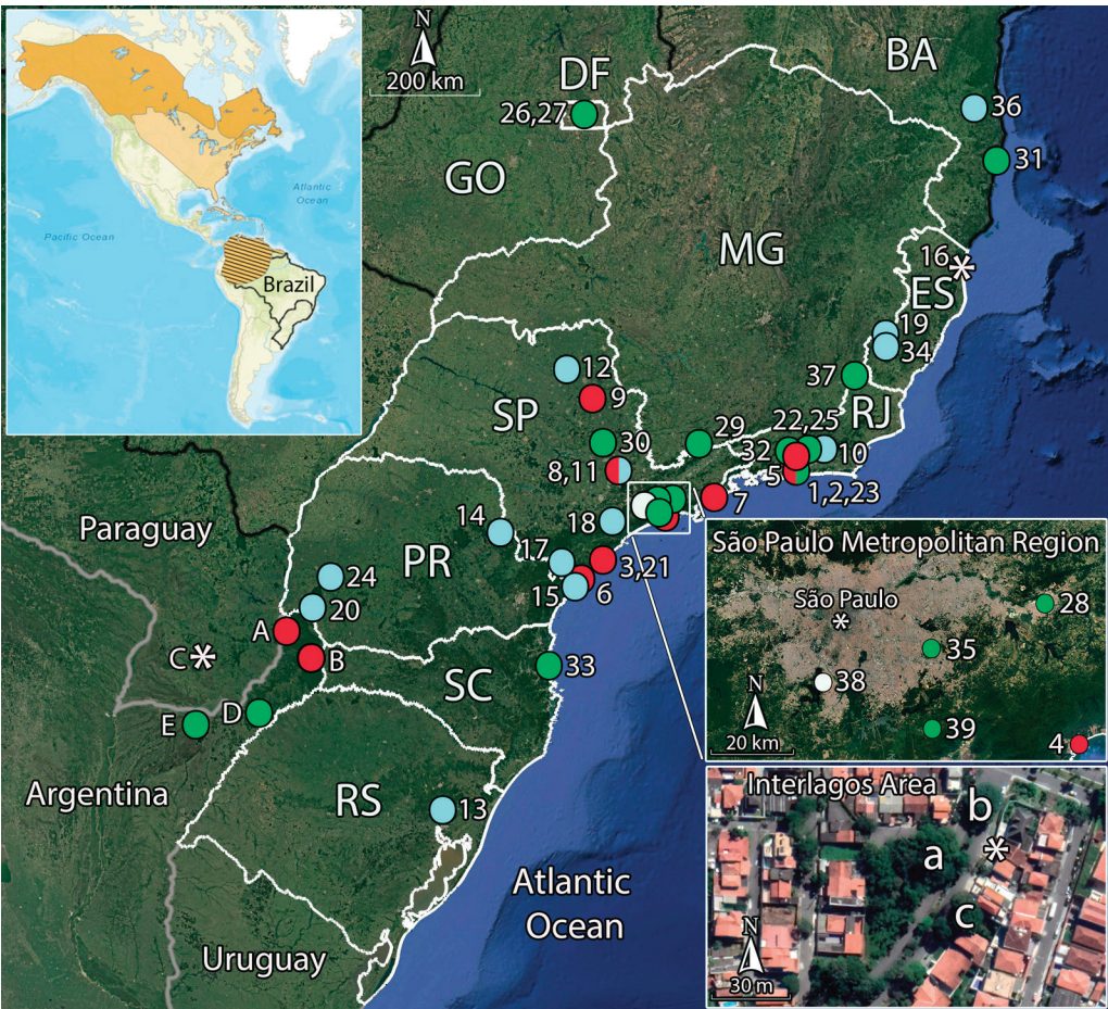
Figure 1. Records of Blackpoll Warbler Setophaga striata in Brazil outside the Amazon. Inset of the Americas (upper left): dark beige = the species' breeding range (northern North America); pale beige = passage (eastern North America, the Caribbean and parts of Middle America) and dark beige + hatch is the main non-breeding area, in northern South America including Amazonia (from BirdLife International 2021). South-east and south Brazil are outlined in black and represented by white borders on the main map, with coloured points on this and the inset of metropolitan São Paulo as follows: red = historical records (specimens and field records between 1969 and 1978); blue = contemporary records in the literature (undocumented sight records from the 1980s, 1990s and 2000s); green = contemporary records on online platforms (documented records starting in 2007); and white = author's field record. Asterisks indicate the two localities mentioned by Paynter (1995), but not otherwise traced. Localities A–E are in Argentina and Paraguay. Brazil state acronyms: GO = Goiás (centre-west region); BA = Bahia (north-east); MG = Minas Gerais, ES = Espírito Santo, SP = São Paulo and RJ = Rio de Janeiro (south-east); PR = Paraná, SC = Santa Catarina and RS = Rio Grande do Sul (south). Inset of Interlagos: (a) forested square; (b) Tipuana tree and (c) Caesalpinia tree. Asterisk indicates the first author's home. Black lines indicate Brazil's borders, grey lines those of other South American countries.

available on request from FS). The bird was observed for an hour, when it moved away and continued calling in the distance.