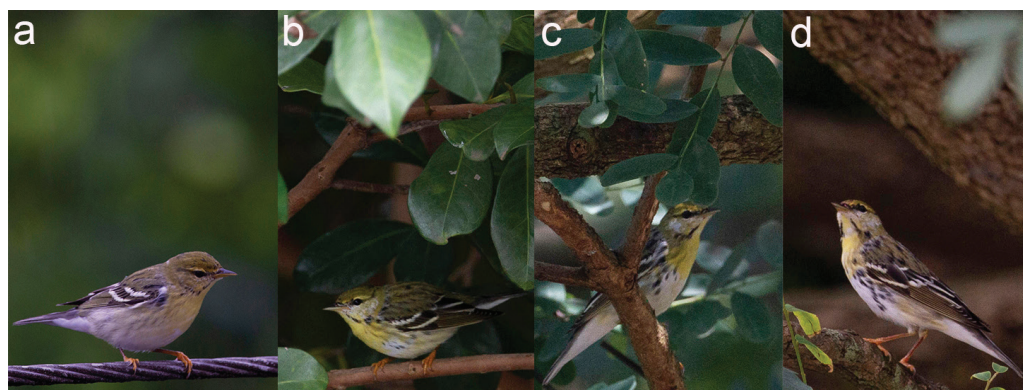
Figure 2. Plumage development of the Blackpoll Warbler Setophaga striata at Interlagos, São Paulo, Brazil: (a) 30 November 2020; (b) 27 December 2020; (c) 23 January 2021 and (d) 30 January 2021 (Fabio Schunck)