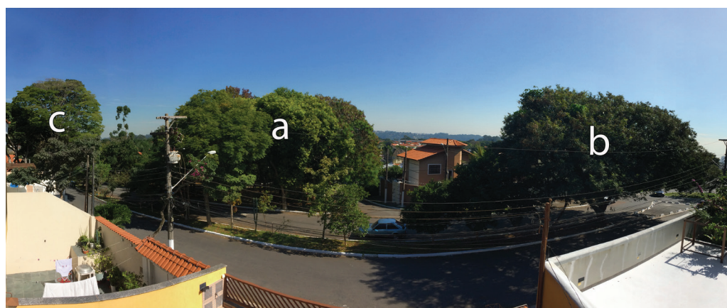
Figure 3. Vegetation at Interlagos, São Paulo, Brazil, in the three areas used by the individual Blackpoll Warbler Setophaga striata : (a) forested square, (b) Tipuana tree and (c) Caesalpinia tree (Fabio Schunck)

main sites (a–c) (Fig. 1, Interlagos inset). It spent most time in a large Tipuana tipu tree with a crown of c.350 m 2 (area b; Fig. 3b). It usually moved between sites using intermediate trees, but occasionally made flights of c.60 m from area b to area c, or vice versa.