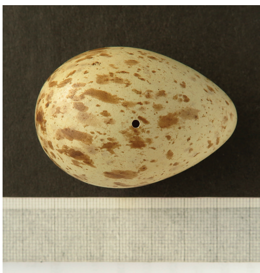
Figure 4 (left). Egg of Slender-billed Curlew Numenius tenuirostris from the Manchester Museum (MANCH BB.5660.2539; egg F)