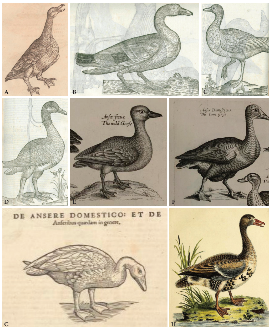
Figure 1. Specimens referred to in the description of Anas anser Linnaeus, 1758, to the extent they were illustrated; A–E in subsection alpha ( 'Anser ferus' ), F–G in subsection beta ( 'Anser domesticus' ) and H in subsection gamma ( 'Anser canadensis fuscus maculatus' ). A: Gessner's (1560: 72) 'Anser ferus' , probably a Bean Goose Anser fabalis (sensu lato) , which was later traced by Aldrovandi (1603: 150; not reproduced here). B: Aldrovandi's (1603: 151) 'Anser ferus Ferraria missus' , the specimen is poorly illustrated but accompanied by a detailed text description of a Greylag Goose. C: Aldrovandi's (1603: 152) 'Anser ferus alius ex Belgio missus à Do' , probably a Bean Goose or Pink-footed Goose Anser brachyrhynchus . D: Aldrovandi's (1603: 153) 'Anser ferus alius quem Antonius Malchiauellus donauit' , resembles no species but perhaps a Greater White-fronted Goose Anser albifrons or domestic goose. E: Willughby's (1678, pl. 69) 'Anser ferus' or 'Wild Goose' , a juvenile Greylag Goose. F: Willughby's (1678, pl. 75) 'Anser domesticus' or 'tame Goose' . G: Gessner's (1555: 141) 'Anser domesticus' . H: Edwards' (1750, pl. 153) plate of Greater White-fronted Goose.