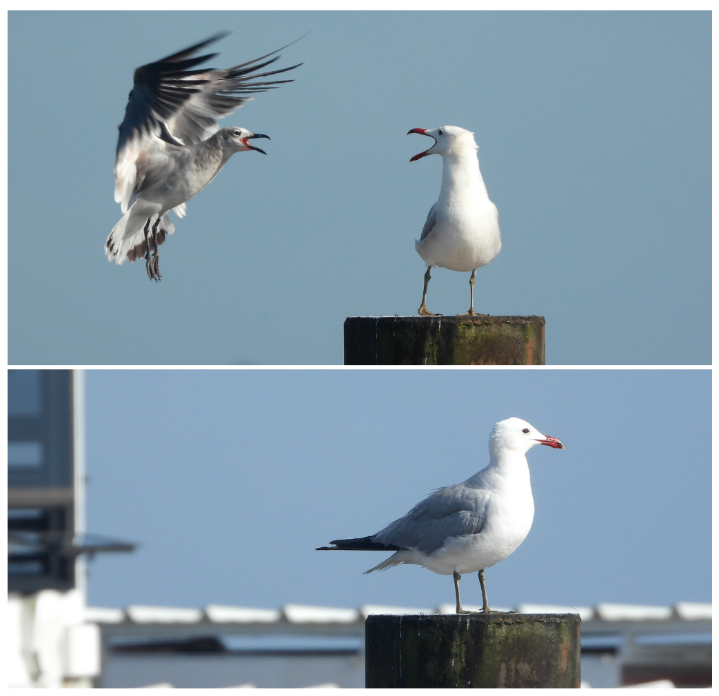
Figures 8-9. Adult Audouin's Gull Ichthyaetus audouinii, Saint-Laurent-du-Maroni, French Guiana, 29 March 2023; note the elegant, pale appearance, red bill, dark eye and olive-grey legs typical of this species (Grégory Cantaloube)

2023), Lesser Black-backed Gull Larus fuscus (GEPOG 2023), Common Gull L. canus (Rufray et al. 2019) and White-winged Tern Chlidonias leucopterus (Rufray et al. 2019, GEPOG 2023).