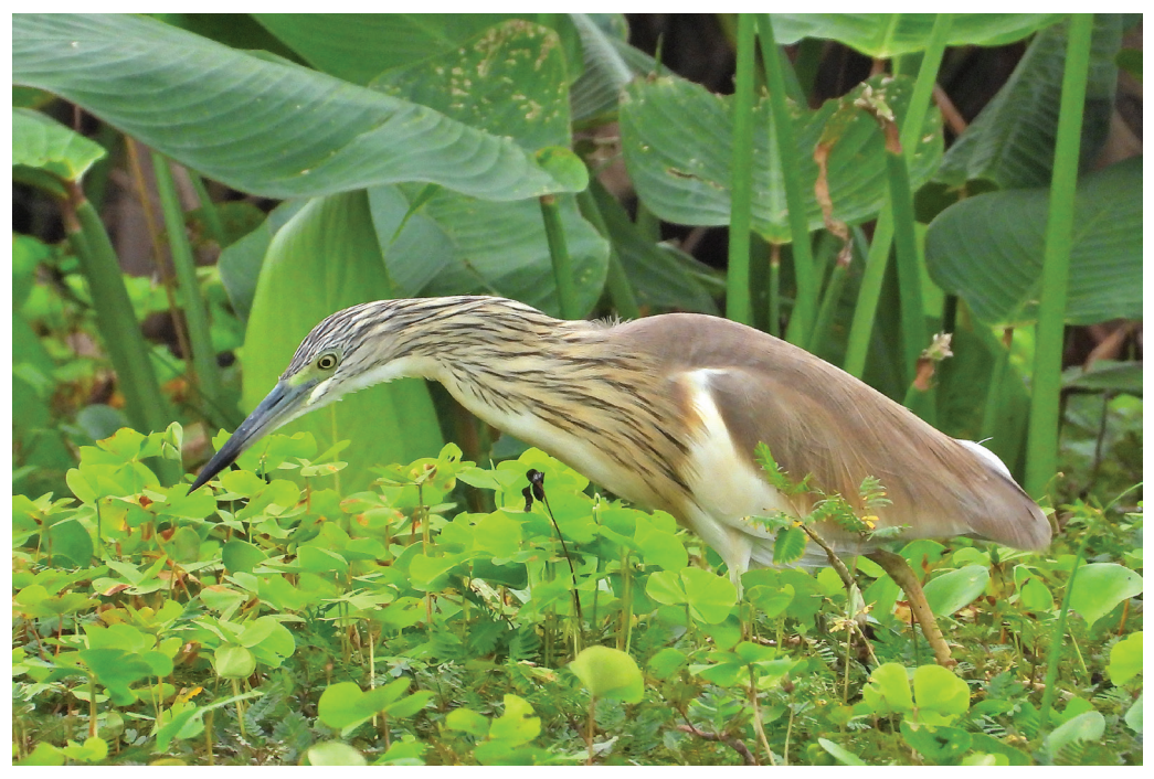
Figure 13. Adult Squacco Heron Ardea ralloides in basic plumage, Guatemala road, Kourou, French Guiana, 12 January 2023 (Olivier Tostain)

© 2024 The Authors; This is an open-access article distributed under the terms of the (cc) Creative Commons Attribution-NonCommercial Licence, which permits unrestricted use, distribution, and reproduction in any medium, provided the original author and source are credited. Downloaded From: https://complete.bioone.org/journals/Bulletin-of-the-British-Ornithologists'-Club on 30 May 2025 Terms of Use: https://complete.bioone.org/terms-of-use