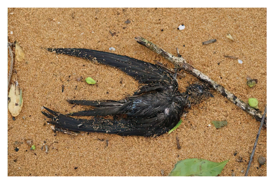
Figure 1. Common Swift Apus apus found dead on Montabo beach, Cayenne, French Guiana, 25 December 2021 (Jean-François Szpigel)

Common Swift is a Eurasian species that winters in Africa south of the equator (Chantler et al. 2020). This is the third record for South America. The first was of an individual