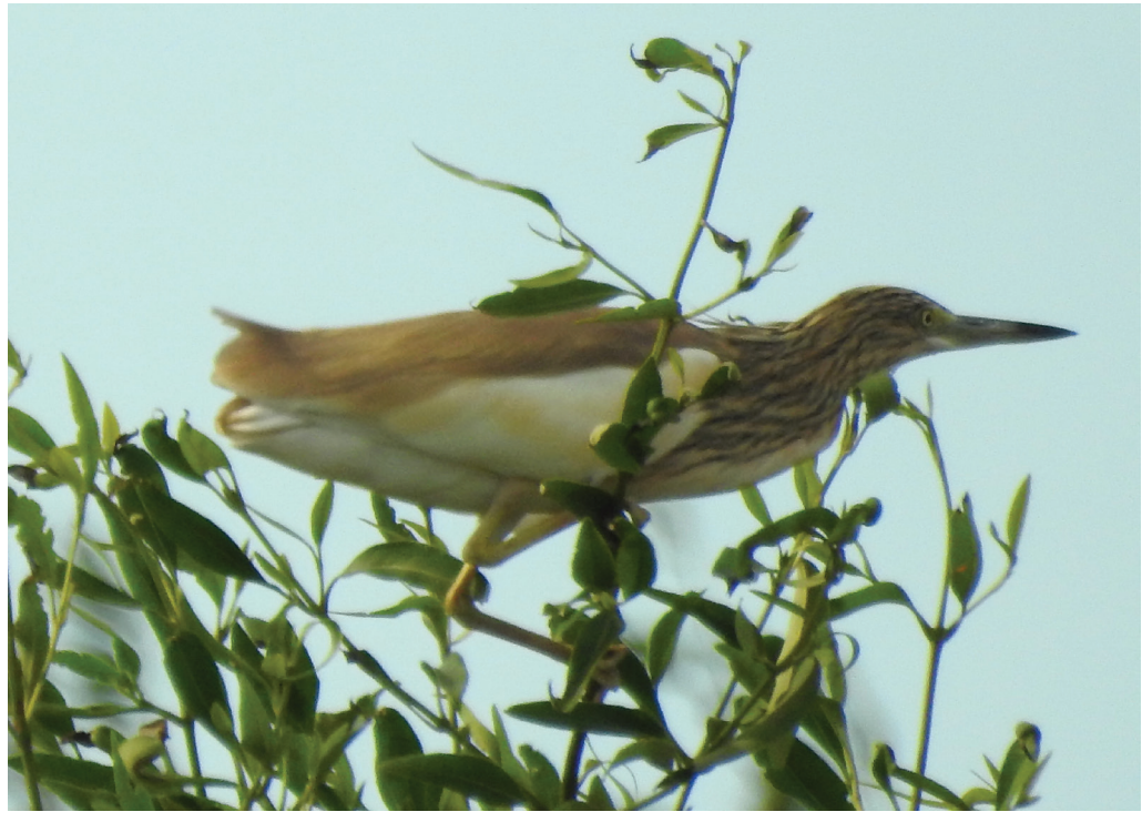
Figure 12. Second-year Squacco Heron Ardea ralloides, Mana, French Guiana, 26 April 2019; note the large streaks on the head and neck and fairly dark mantle indicating a second-year (Grégory Cantaloube)