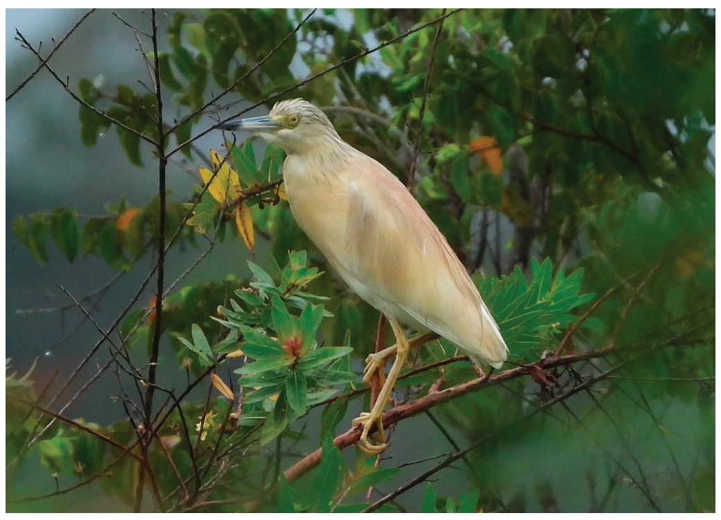
Figure 14. Adult Squacco Heron Ardea ralloides coming into alternate plumage, Panato wetland, Awala-Yalimapo, French Guiana, 3 March 2023 (Grégory Cantaloube)

where the individual was seen in January, but it is possible that the two records involved the same bird that had moulted in French Guiana.