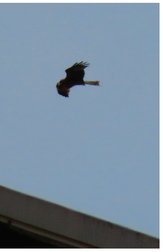
aegyptius, Cayenne, French Guiana, 3 May 2023; note adult-type yellow bill distinguishing it from Black

Five years after the Black Kite sighting in Kourou, another Old World kite was identified in French Guiana. On 3 May 2023, a Yellow-billed Kite, probably an adult, was seen in flight by LE in Cayenne (04°56'22"N, 52°20′01″W). Forty-five minutes later, it was photographed (Fig. 17) c.500 m east of the first site by HF & A. Grave. The uniformly pale bill, slender jizz with five visible primaries, chocolate-brown mantle and reddish-brown belly are diagnostic criteria that separate this species from Eurasian M. migrans (Clark & Davies 2018). Although still usually considered a subspecies of the latter (David et al. 2021), Yellow-billed Kite is increasingly treated as a separate species (Clark & Davies 2018, Gill et al. 2024). Distinguishing between the two subspecies of Yellow-billed Kite, aegyptius (Egypt, south-west Arabia and the East African coast) and parasitus (West, Central and southern Africa, Madagascar and the Comoros) is impossible based on the photos. Unlike Black Kite, Yellow-billed Kite is not a long-distance migrant. M. a. aegyptius is usually considered resident, whereas Figure 17. Probable adult Yellow-billed Kite Milvus parasitus undertakes complex movements influenced by the rainy season (Davis et al. Kite M. migrans and the slightly forked tail (Hugo 2021). Records of vagrancy far outside the Foxonet) known range of both subspecies are few and poorly documented (eBird 2023) but include