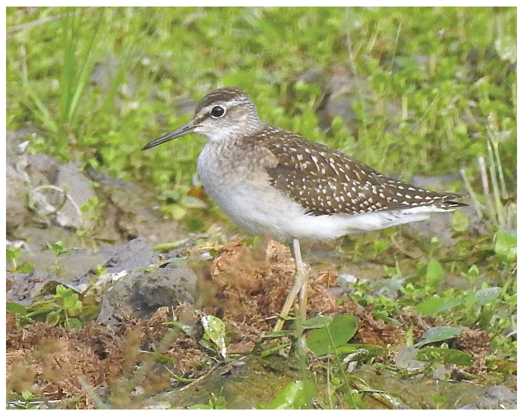
Figure 2. First-year Wood Sandpiper Tringa glareola, Montsinéry-Tonnégrande, French Guiana, 13 September 2019; note the long, prominent white supercilium reaching behind the eye, densely speckled upperparts, yellowish-green legs and diffusely spotted breast (indicating a first-year) (Olivier Tostain)

On 11 September 2019, a first-year was photographed (Figs. 2–3) by PL feeding in wet pastures at Lambert equestrian centre, Montsinéry-Tonnégrande (04°52'58"N, 52°31'19"W). These pastures, still partially flooded at the start of the dry season, were highly attractive to migrant waders. Over a few weeks, 13 species were observed there including American Golden Plover Pluvialis dominica and Pectoral Sandpiper Calidris melanotos. The Tringa stayed at least three days, being seen again on 13 September by HF, PL & OT. There were no attempts to find it again thereafter and the site is known to have quickly dried out.