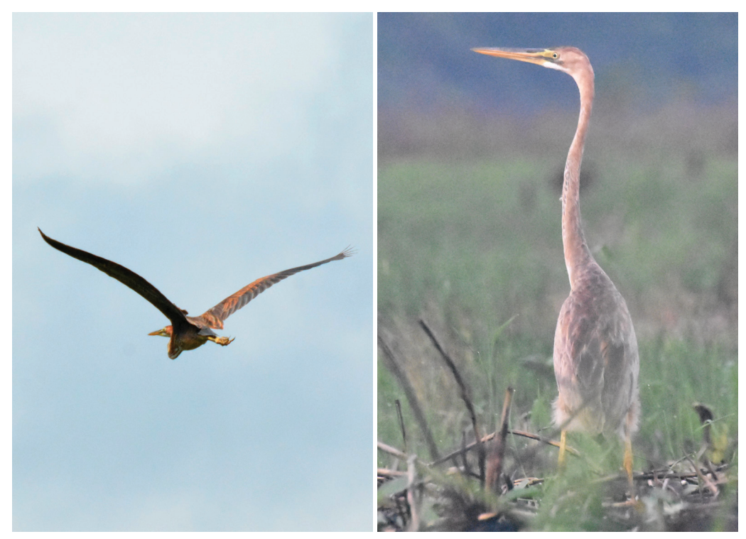
Figure 10 (left). Subadult Purple Heron Ardea purpurea , Regina, Kaw-Roura National Nature Reserve, French Guiana, 29 May 2018; note the pale upperwing-coverts indicating a subadult (Benjamin Ferlay)

On 26 April 2019, a second-year was photographed (Fig. 12) in rice fields at Mana on the west coast of French Guiana (05°38′27″N, 53°40′59″W) by GC. The bird was foraging along a canal, probably on crabs, when it was flushed by GC. During the following days, several observers failed to find the bird in this vast and largely inaccessible area, but given the suitability of the habitat it is possible that the bird was still present. On 8 January 2023, an adult in basic plumage (Fig. 13) was photographed by C. Marty & A. Vinot in a regularly surveyed flooded pasture along the Guatemala Road near Kourou (05°06′14″N, 52°35′02″W). The bird was seen several times at the same location feeding on frogs, and was last reported on 12 January (M. Baumann, HF, T. Ferrieux & OT). Less than three months later, on 2 March 2023, an adult in nearly alternate plumage was photographed by I. Morisset at Panato wetland, Awala-Yalimapo (05°44′30″N, 53°55′54″W); it was photographed (Fig. 14) again next day by M. Baumann & GC. This site is c .160 km west of