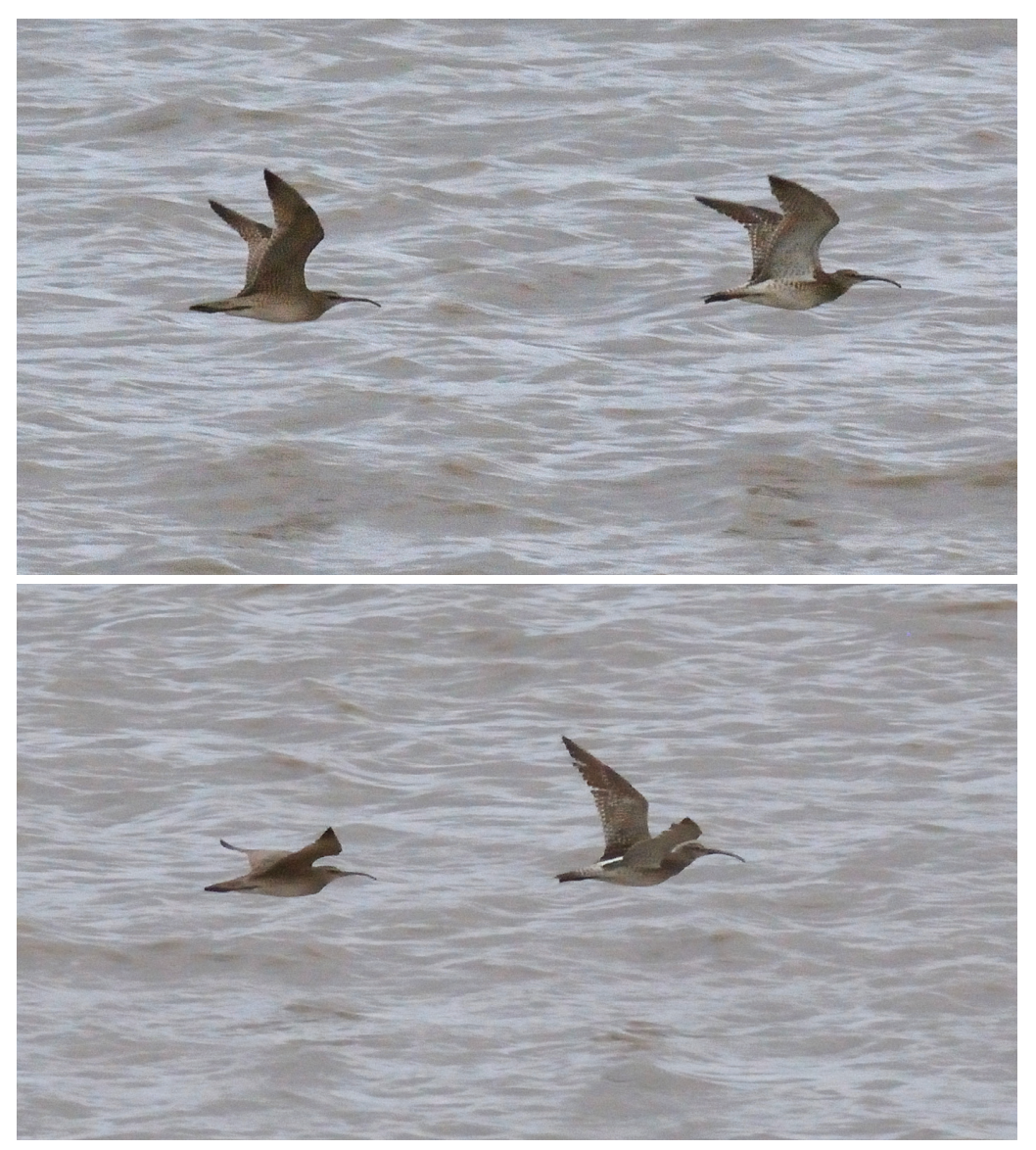
Figures 4–5. Eurasian Whimbrel Numenius phaeopus phaeopus (right) with Hudsonian Whimbrel N. p. hudsonicus , Pointe des Amandiers, Cayenne, French Guiana, 28 April 2020; note the pale underwing-coverts contrasting with brown underwing-coverts of hudsonicus and white rump continuing onto the back

same site, OC, LK & OT photographed what was probably the same individual, both times being identified by the white rump and white underwing-coverts via direct comparison with Hudsonian Whimbrel (Skeel & Mallory 2020).