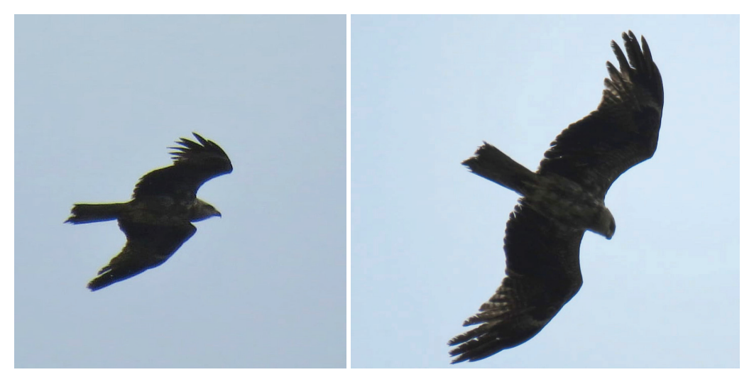
Figures 15–16. Probable second-year Black Kite Milvus migrans, Iles du Salut, Kourou, French Guiana, 10 May 2018; note worn plumage without visible forked tail, pale greyish head, black bill contrasting with yellow cere, dirty streaked belly (suggesting a second-year) and pale area at the base of the primaries (Quentin d'Orchymont)

Other records have been documented in the West Indies, in the Bahamas, Dominica, Guadeloupe, Barbados, Grenada (K. Carter, https://ebird.org/checklist/S93838051) and the British Virgin Islands (Norton 2000, Buckley et al. 2009, Kirwan et al. 2019; A. Levesque in litt. 2022).