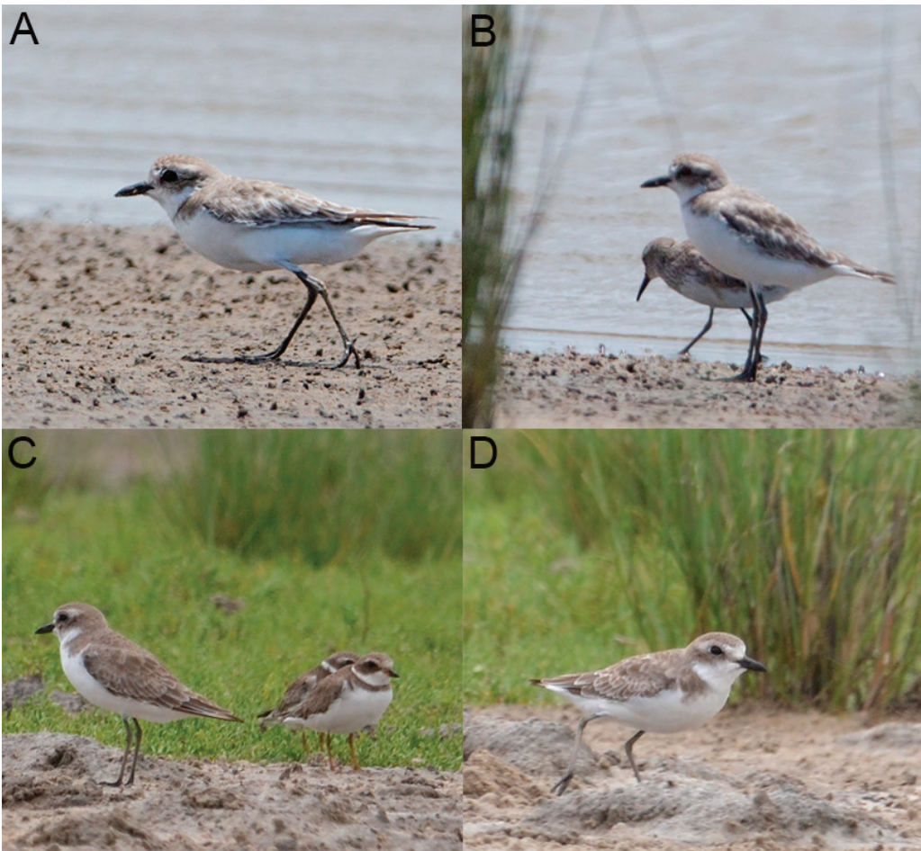
Figure 2. Greater Sand Plover Anarhynchus leschenaultii , Parque Nacional da Lagoa do Peixe, Rio Grande do Sul, Brazil, December 2015, with a White-rumped Sandpiper Calidris fuscicollis in B and two Semipalmated Plovers Charadrius semipalmatus in C