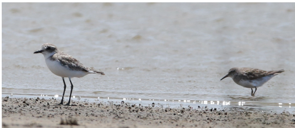
Figure 4. Greater Sand Plover Anarhynchus leschenaultii , Parque Nacional da Lagoa do Peixe, Rio Grande do Sul, Brazil, December 2015, with White-rumped Sandpiper Calidris fuscicollis on right; same individual as in Fig. 2 (André Luiz Fraga Briso)

Common Redshank Tringa totanus and Lesser Black-backed Gull Larus fuscus (Pacheco et al. 2021).