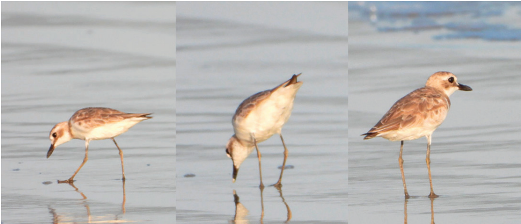
Figure 3. Greater Sand Plover Anarhynchus leschenaultii , municipality of Bertioga, São Paulo, Brazil, 17 September 2023 (Marcelo Henrique Marques)