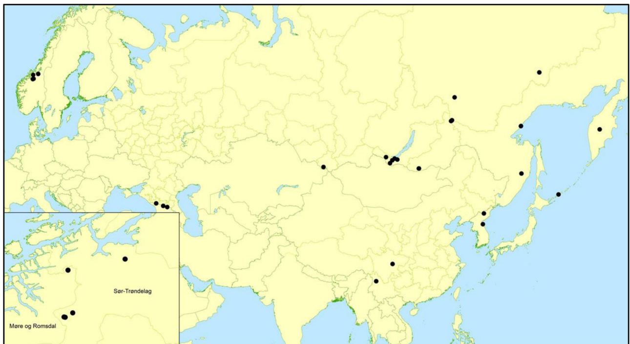
Figure 4. Confirmed distribution of Lophozia lantratovae globally and in central Norway (inset map).

ing, dead Betula pubescens , 35 cm dbh in Picea abies -dominated Vaccinium myrtillus forest., 2021.08.21 T. Prestø, det. T. Prestø (TRH B-116253).