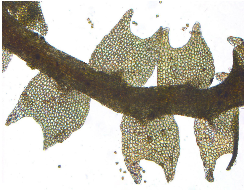
Figure 3. Lophozia lantratovae shoot with leaves below shoot apex (TRH B-112600).