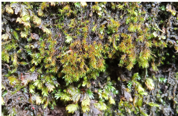
Figure 2. Blindia acuta (Hedw.) Bruch & Schimp. and Fissidens dubius P. Beauv. on schist outcrop (Jalhay, Belgium, 25 June 2022).