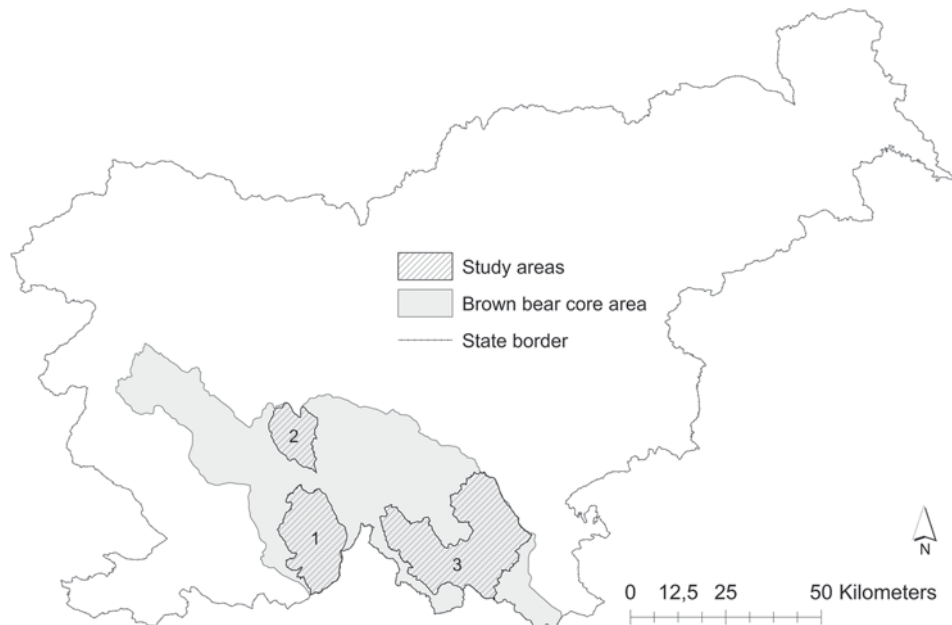
Figure 1. Locations of the three study regions in Slovenia: 1 - Snežnik, 2 - Menišija, 3 - Kočevsko. The shaded area represents the core area of the brown bear population in Slovenia.

for bears and wild ungulates) at average densities of one site per every 5.6 km 2 . The amount of maize provided per year was estimated at 70–280 kg km -2 and the amount of livestock carrion at 33–146 kg km -2 (Kaczensky 2000, Adamič 2005). Approximately two-thirds of feeding sites were supplied with food throughout the year, including winter. Carrion from wild ungulates was also available in nature from gut piles left at hunter kill sites, from the prey remains of gray wolves Canis lupus and Eurasian lynx Lynx lynx (Krofel et al. 2012b) and from animals that died due to other causes, cumulatively estimated to amount to another 60–120 kg km -2 year -1 (data from Stergar et al. 2009). Average red deer Cervus elaphus and roe deer Capreolus capreolus densities in the study area were 6.7 and 1.7 km -2 , respectively (Adamič and Jerina 2010). In 2004, supplemental feeding of bears with livestock carrion was forbidden due to the adoption of EU veterinary legislation (Kavčič et al. 2013). Previous carrion feeding sites have remained active and have been supplied with maize only since the ban. Otherwise, supplemental feeding practices have remained similar. The ban on supplemental feeding with livestock carrion did not affect bear visitation rates to feeding sites (Kavčič et al. 2013).