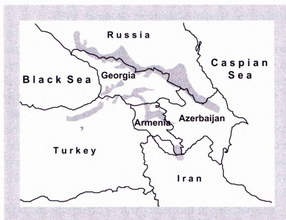
Figure 1. Distribution of the Caucasian black grouse (after Storch 2000).

The Caucasian black grouse is the only grouse species represented in Turkey. According to recent liter-