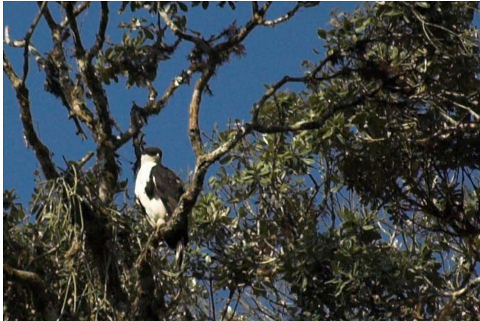
Figure 2. An adult Cassin's hawk-eagle Spizaetus africanus , photographed in Ndundulu Forest, Tanzania, August 2006.

Rüppell, 1836. Single birds were spotted on two occasions sitting in the tall upper canopy of the forest (which reaches over 50 m in height), and on three occasions soaring in circles low over the forest canopy. On two occasions a bird was heard calling while in flight, a short high-pitched call repeated several times, which was later recorded and compared with and noted to sound identical to an audio recording of Cassin's hawk-eagle. It is not possible to confirm whether all encounters have been with the same or different individuals.