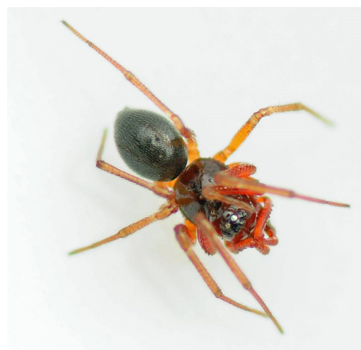
Fig. 1: Live male of Prinerigone vagans (Audouin, 1826) from Poland, dorsal view

Material. POLAND, Silesia, The Silesian Beskids mountain range, Istebna, bank of the river Olza, 49.57397° N, 18.90317° E (WGS 84), 1♂, 552 m a.s.l., collected by hand, 16.viii.2015, leg. Luis Guttenberger.