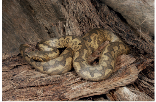
Figure 9. Candoia paulsoni mcdowellii from Milne Bay Province, Papua New Guinea.

Conservation Status. This subspecies has not been assessed, though it is likely persecuted (O'Shea, 1996).