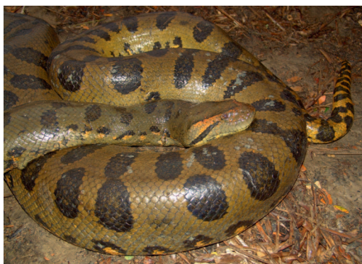
Figure 7. Eunectes murinus from Estado Apure, Venezuela.

Taxonomy. Originally described as Boa murina by Linnaeus. When Wagler (1830) described the genus Eunectes , B. murina became the type species. Aside from Stull (1935) resurrecting the old Linnaean name scytale to replace murinus , and the epithet