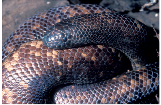
Figure 8. Calabaria reinhardtii , locality unknown (captive specimen).

Taxonomy. Described by Schlegel (1848) as Eryx reinhardtii , the type of the genus was given as Calabaria fusca Gray 1858. The genus was referred to as both Rhoptrura and Eryx in the 19th century until Boulenger (1893) stabilized the monotypic genus as C. reinhardtii . Kluge (1993) placed