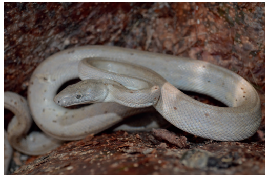
Figure 4. Chilabothrus argentum from Conception Island, Bahamas.