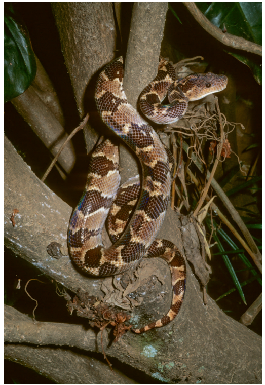
Figure 16. Sanzinia volontany from Tsingy de Bemaraha, Madagascar.

Despite some species of booids being among the most iconic of reptiles in general and perhaps including some of the most commercially sought-after species of snakes