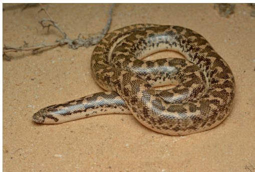
Figure 14. Eryx jaculus from Caesarea, Israel.

Type Specimen. Lectotype NRM Lin-12, an adult of unknown sex from Egypt. The holotype is likely lost (Kluge, 1993).