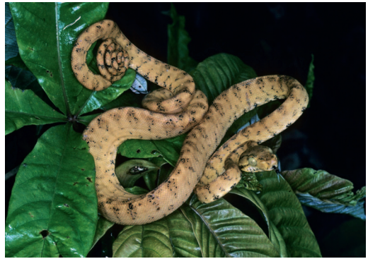
Figure 5. Corallus hortulanus from Pará, Brazil.

Taxonomy. Originally described as Boa grenadensis , Barbour (1935) subsequently relegated it to a subspecies of B. cookii ; meanwhile, Stull (1935) synonymized it with B. enydris cookii ; Barbour (1937) continued to recognize it as a subspecies of B. cookii . After Forcart (1951) untangled Boa , Constrictor , and Corallus and McDiarmid et al. (1996) did the same for C. enydris/hortulana , Henderson (1997) resurrected Corallus grenadensis to full species status. Recent molecular evidence (Colston et al., 2013; Reynolds et al., 2014) shows C. grenadensis