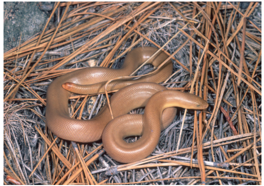
Figure 10. Charina bottae from Kern County, California.