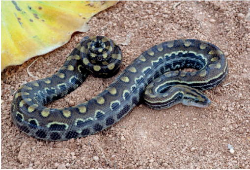
Figure 6. Epicrates crassus from Reserva Ecológica do IBGE, Brasília, Distrito Federal, Brazil.

Type Specimen. An adult, USNM 12413, from Gardosa, Río Paraná, Paraguay.