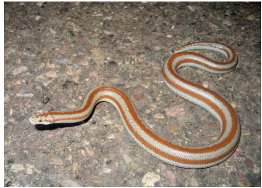
Figure 11. Lichanura trivirgata from Bahia Los Angeles, Mexico.