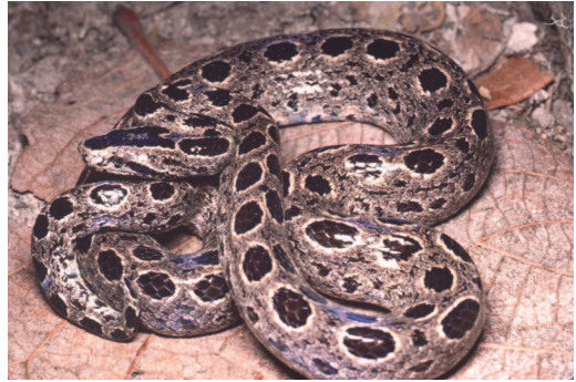
Figure 13. Ungaliophis continentalis from Chiapas, Mexico.

Distribution. Southern Nicaragua, Costa Rica, Panama to northwestern Colombia