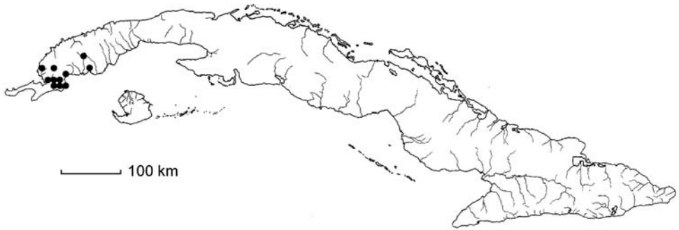
Fig. 1. Map of the Cuban distribution of Cleome guianensis .

Distribution. – From S Mexico (Baja California to Chiapas) and Belize through Mesoamerica to Colombia, British Guiana and Brazil. In westernmost Cuba it grows in pinelands on white sand (Fig. 1).