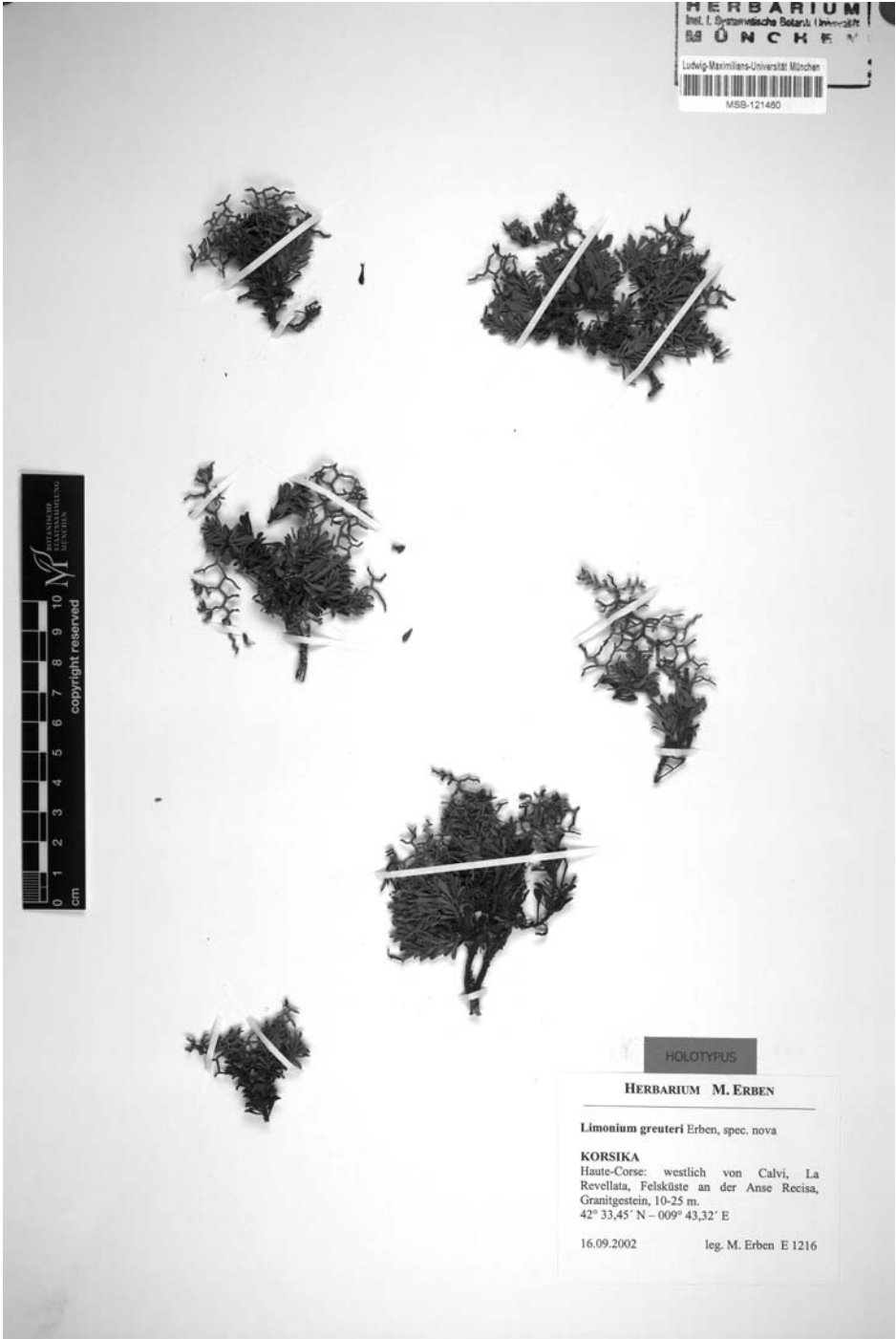
Fig. 1. Limonium greuteri , holotype.