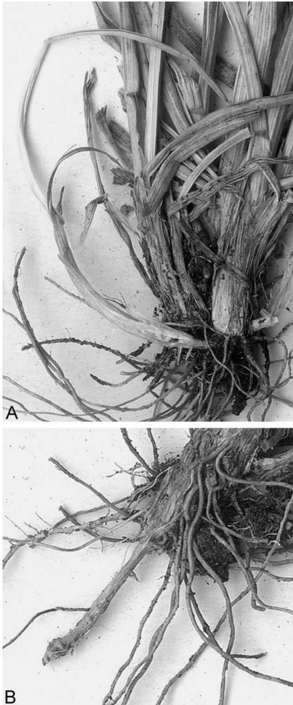
Fig. 2. Poa greuteri – A: extravaginal innovation shoot; B: short rhizome with stolon. – Photographs taken from the type collection.