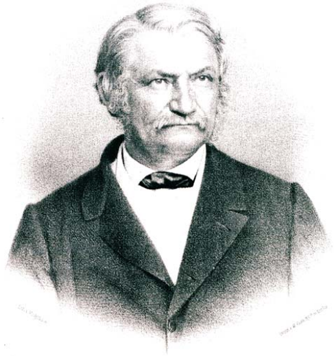
Fig. 1. Portrait of Kotschy [from Schweinfurth 1868].

Kotschy also made freshwater fish collections from around Shiraz, including the streams of the Maharlu basin in the Shiraz valley, the Kor River basin north of Shiraz, the Mond River (=