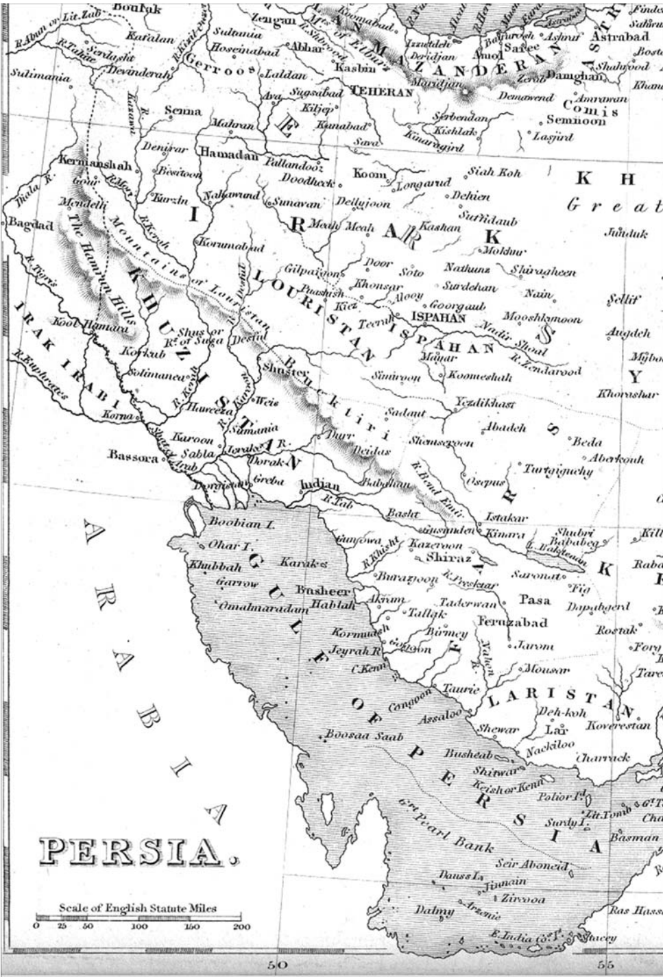
Fig. 2. Map of Iran by Dower (1836) showing area of study.