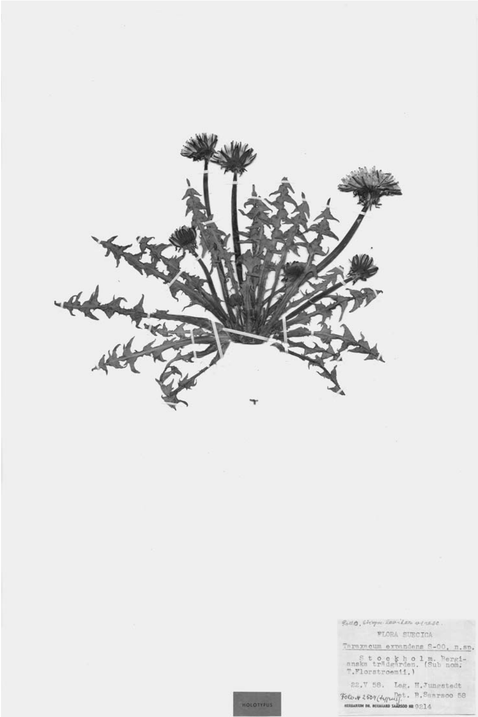
Fig. 2. Taraxacum expandens , holotype (S).