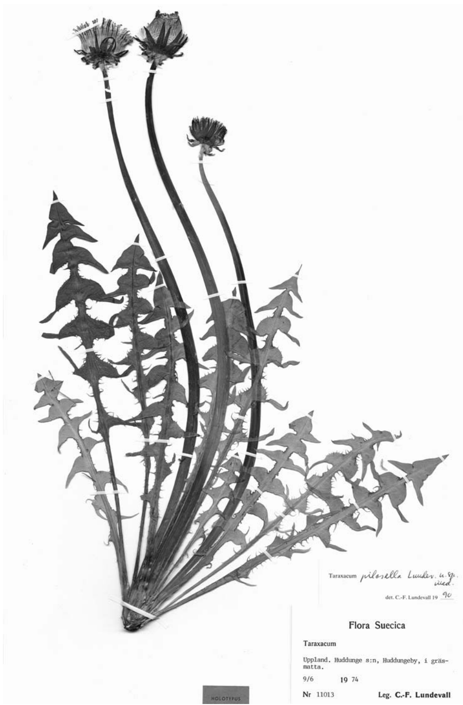
Fig. 6. Taraxacum pilosella , holotype (S).