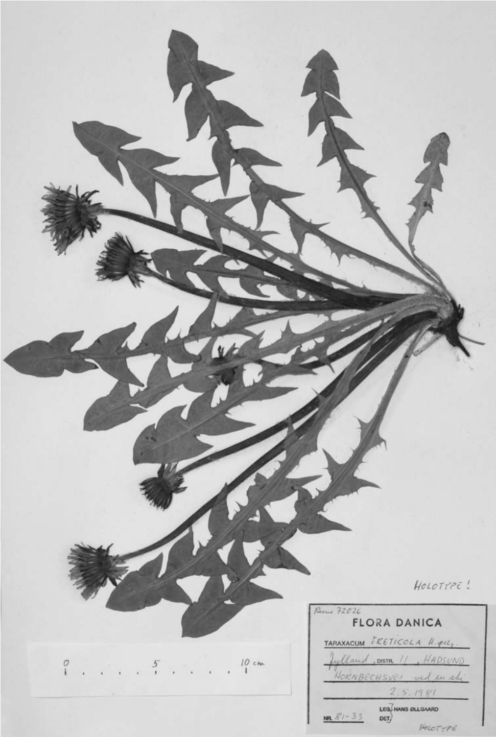
Fig. 1. Taraxacum freticola – holotype specimen. Downloaded From: https://complete.bioone.org/journals/Willdenowia on 10 Jul 2025 Terms of Use: https://complete.bioone.org/terms-of-use