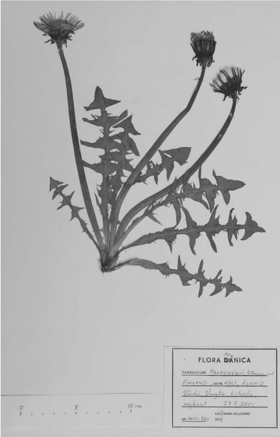
Fig. 7. Taraxacum palmgrenii – specimen Øllgaard & Räsänen HØ-01-330 (C).