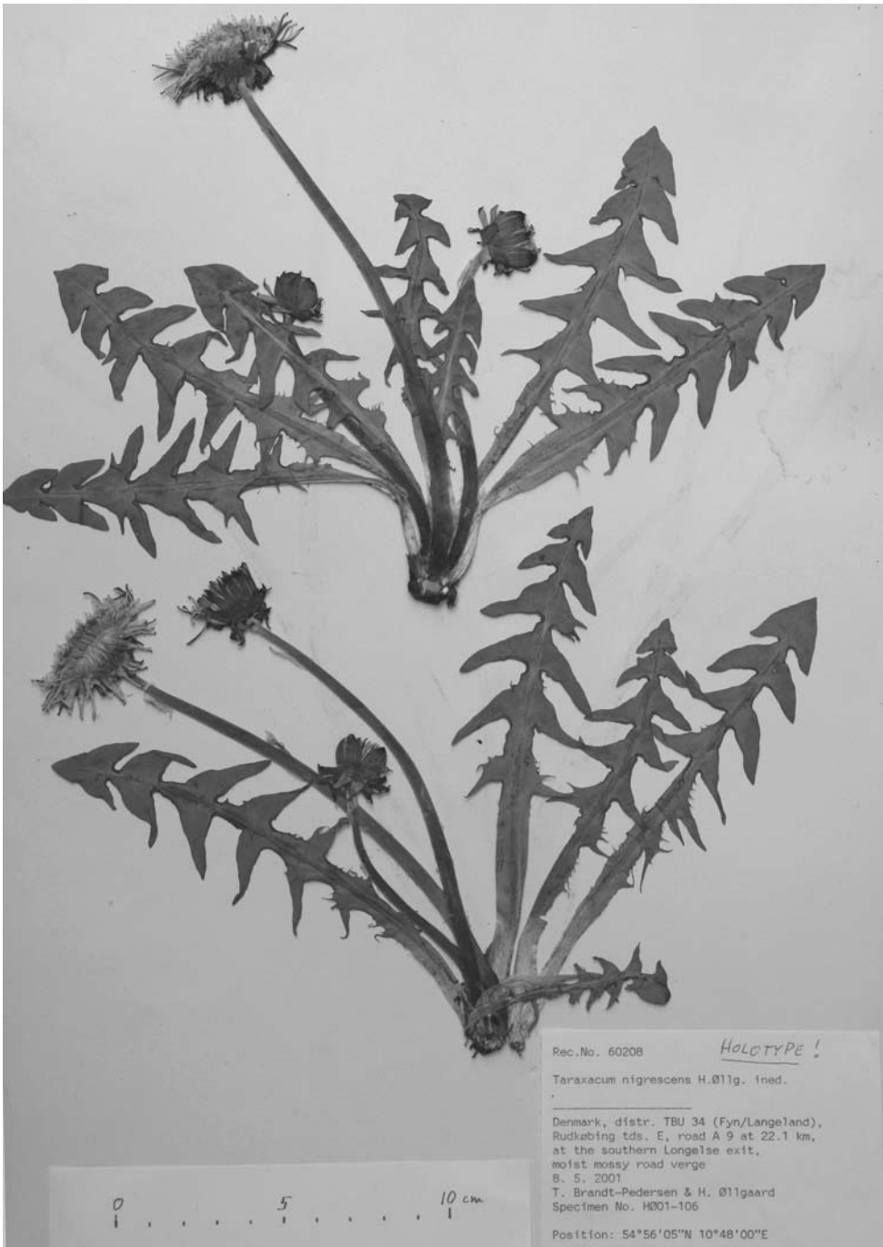
Fig. 5. Taraxacum nigrescens – holotype specimen.