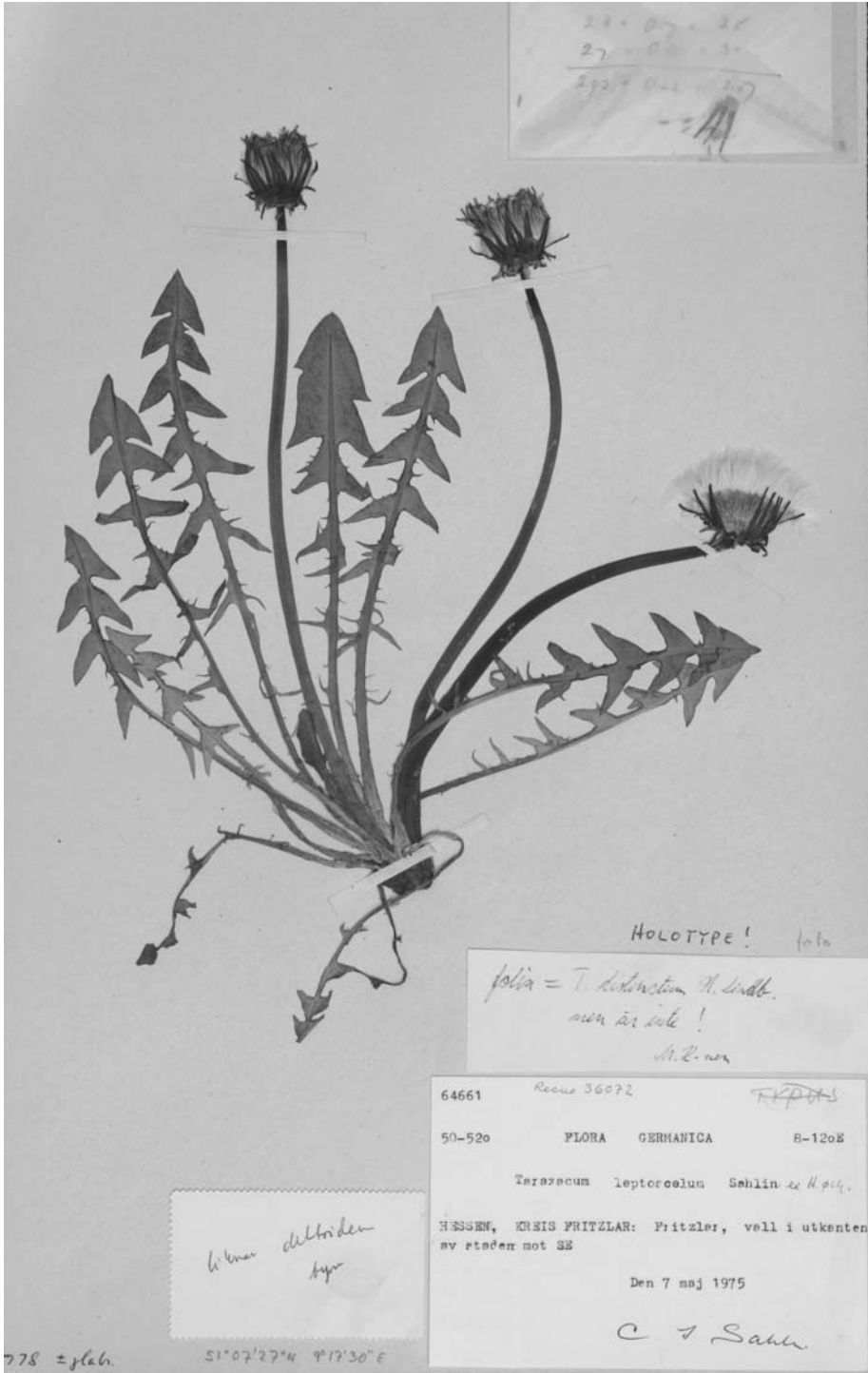
Fig. 4. Taraxacum leptoscelum – holotype specimen. Downloaded From: https://complete.bioone.org/journals/Willdenowia on 10 Jul 2025 Terms of Use: https://complete.bioone.org/terms-of-use