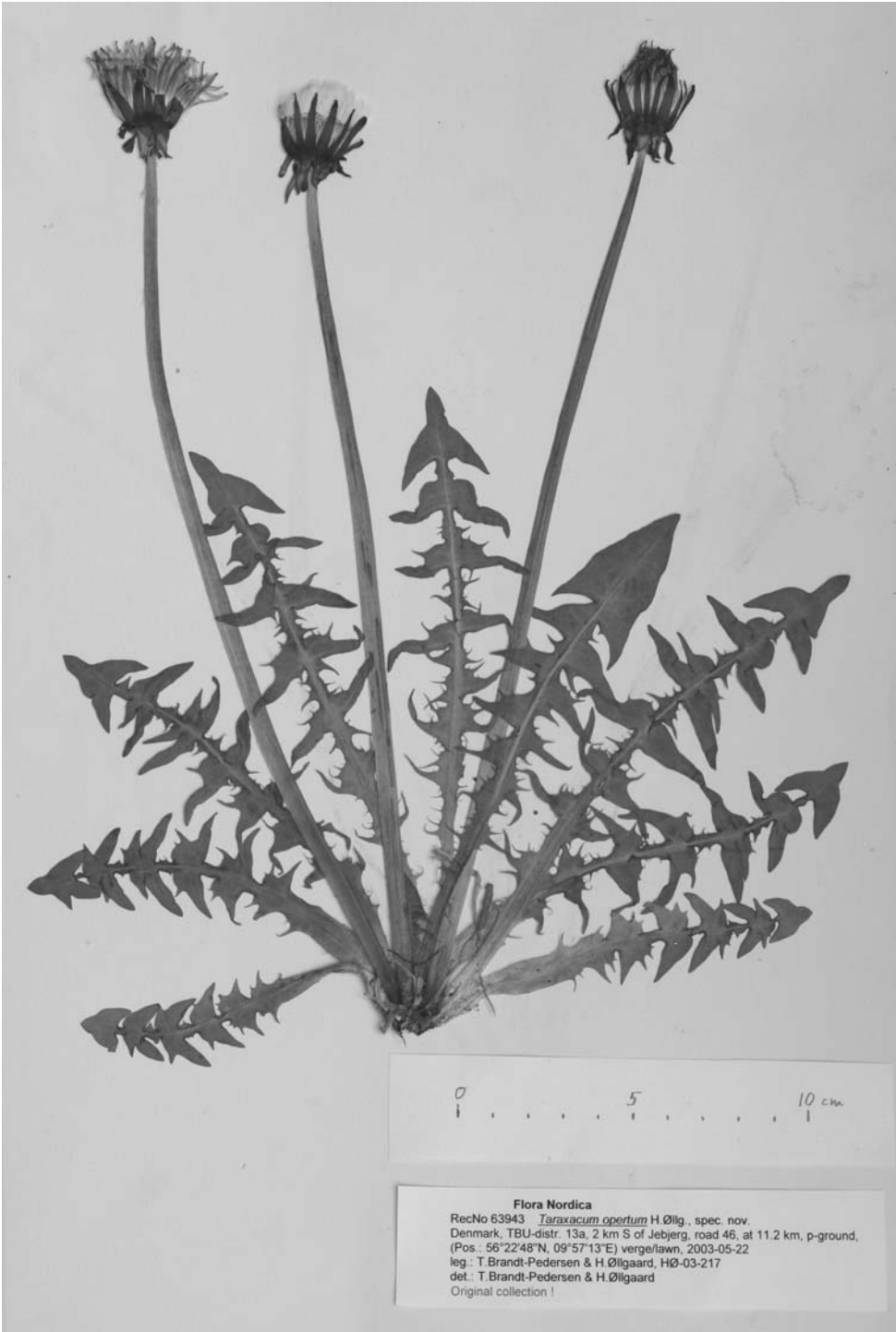
Fig. 6. Taraxacum opertum – holotype specimen. Downloaded From: https://complete.bioone.org/journals/Willdenowia on 10 Jul 2025 Terms of Use: https://complete.bioone.org/terms-of-use