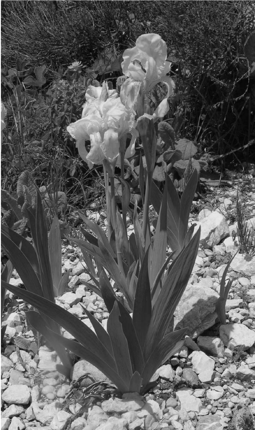
Fig. 2. Iris orjenii – plants from the type collection cultivated at the Botanischer Garten München.