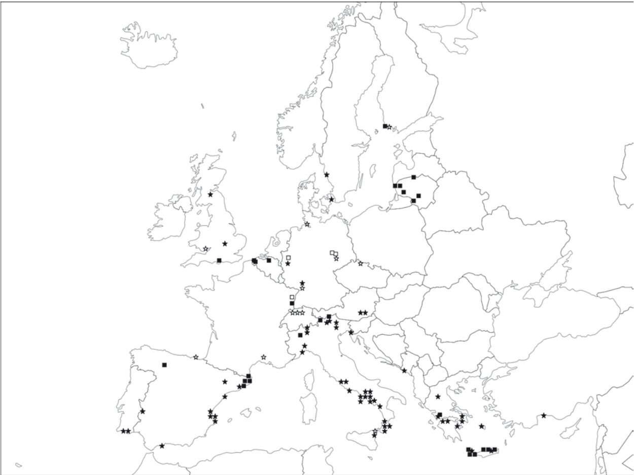
Fig. 2. Digitaria ciliaris in Europe. – Revised herbarium vouchers (empty stars: collected before 1950, filled stars: after 1950) and records drawn from the literature (empty squares: before 1950, filled squares: after 1950). In the event that literature records and herbarium vouchers coincide, only the latter are presented on the map. Symbols may stand for more than one record if sites are too close to be indicated separately. The Atlantic islands (Macaronesia) with their respective records are not shown. See the text for details.

MONTENEGRO: Tivat, Lastra, st. betonski zid iznad mora, 15.9.1996, Karamari (?) 1005 (BEOU). SWEDEN: SÖDERMANLANDS LÄN: Nyköping, Perioden, inford med bomull, 9.1915, Carl Blom (W). SWITZERLAND: TICINO: Sessa (Malcantone) Scree, Sasso Biotta, felsige Stellen in Waldlichtung, 18.8.1991, E. Landolt (ZT). – ZUG: Lorenzital östlich von Baar, Unkraut in Maisfeld, 4.9.1983, K. U. Kramer (Z). – ZÜRICH: Schlieren, Schlatt, Waldschlag, 12.10.1990, E. Landolt (ZT); Stallikon, Maisfelder S Baldern, 31.8.1991, E. Landolt (ZT); Fluntern, Zürichberg, hinter dem Chlösterli, Maisacker, 14.9.1992, E. Landolt (ZT); Uitikon, Maisacker N Kantonalen Erziehungsanstalt, 24.9.1994, E. Landolt (ZT).