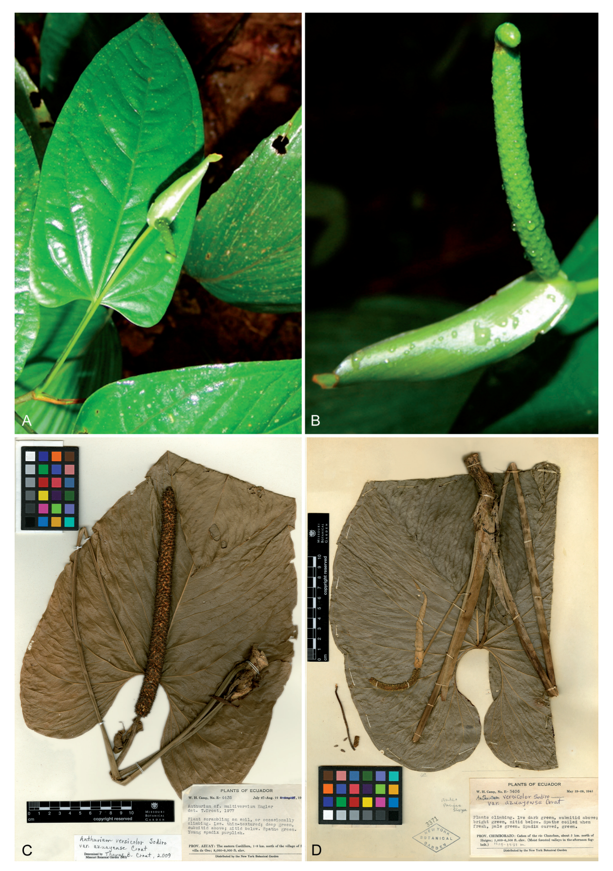
Fig. 3. A–B: Anthurium patens – leaf blade, adaxial surface and inflorescence (A); inflorescence, close-up (B); C–D: A. versicolor var. azuayense – type specimen, Camp E-4435; D: paratype specimen, Camp E-3406.