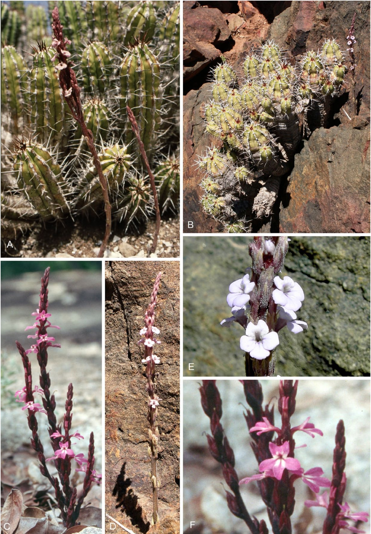
Fig. 2. A, B, D, E: Striga barthlottii , habit and habitat with its host Euphorbia officinarum subsp. echinus (A, B, D), corolla in detail (E); A from Cap Rhir, photograph April 2006 by W. Barthlott, B, D, E from Djebel Izmi N of Et Tnine, photographs 2.4.2005 by J. Mutke. – C + F: S. gesnerioides , habit (C) and corolla in detail (F), from Zimbabwe; photograph February 1994 by R. Seine. Downloaded From: https://complete.bioone.org/journals/Willdenowia on 19 May 2025 Terms of Use: https://complete.bioone.org/terms-of-use