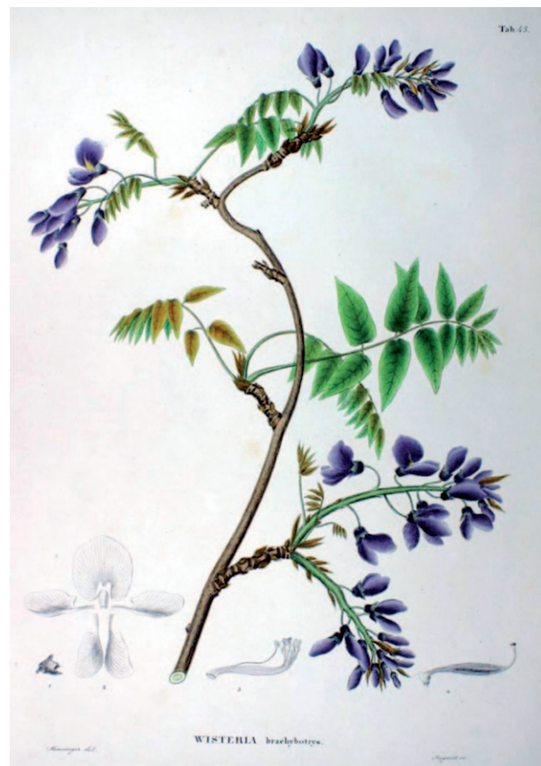
Fig. 2. Wisteria brachybotrys , coloured lithograph by W. Siegrist based on S. Minsinger, the latter based on Kawahara Keiga. – From Siebold & Zuccarini (1839: t. 45), London, British Library.

eral leaf axils per stem during summer. Flowers are pale whitish green, creamy white, pale yellow or rarely purple. This species has been placed in the separate genus Millettia Wight & Arn. by some workers, based on the absence of a pair of thickened callosities or auricles at the base of the standard petal, such auricles being present in other species of Wisteria . This is now considered to be an autapomorphic character for W. japonica . Recent studies (Hu & al. 2002) have shown that the genus Callerya Endl. is in fact the nearest relative to Wisteria based on nuclear DNA sequence data.