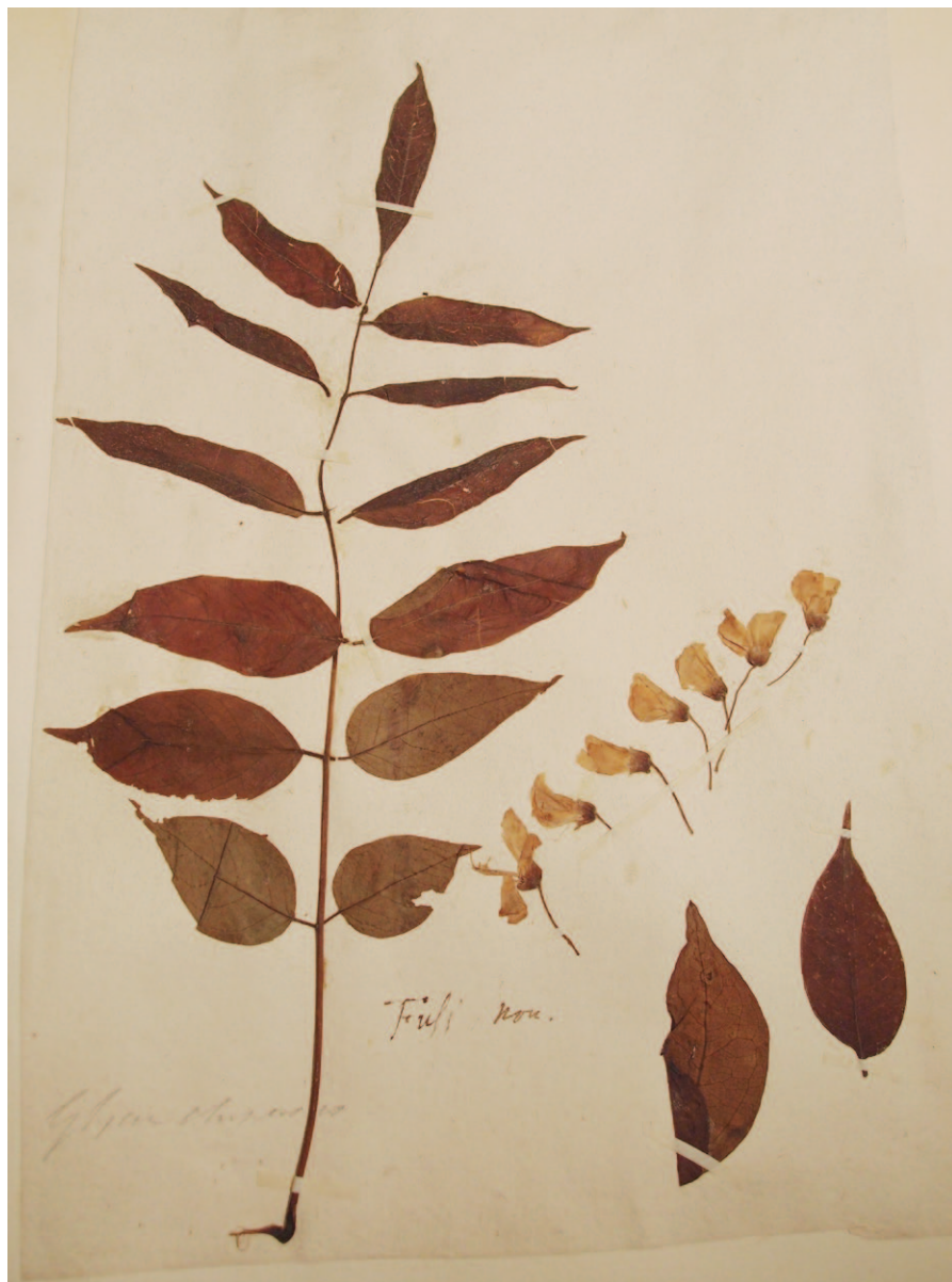
Fig. 5. Wisteria floribunda , specimen from Japan, 1692, leg. E. Kaempfer. – London, Natural History Museum, Department of Life Sciences, Hortus Siccus 211, f. 83.1.

Wisteria floribunda is well characterised on the previous page (Kaempfer 1712: 856) as “Too, vulgò Fudsi