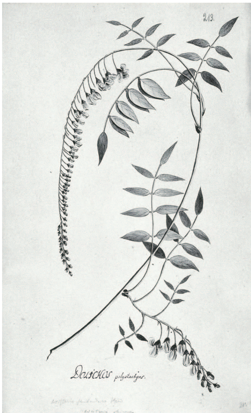
Fig. 7. "Iconohybrid", anonymous illustration showing characters of Wisteria brachybotrys and W. floribunda . – Saint Petersburg, Russian Academy of Sciences, Komarov Botanical Institute, Library, Icones plantarum rariorum f. 213.

In his introduction to the list of Dolichos species, Houttuyn (1779: 142) uses the vernacular name "Slingerboon" [Twining Bean] for all species in the genus. Houttuyn mentions that Clayton had observed the plant in Virginia, having siliquas like pea pods, and that he had received under this name ( D. polystachyos ) a twig of a plant from Japan, illustrated in t. LXIV, fig. 2 (Fig. 8). He makes a point of the leaves being pinnate rather than trifoliolate as commonly found in the genus and describes the characters depicted in the plate. He makes a reference to the nine united filaments and the single filament as well as to the pair of calluses on the standard petal. Finally his description in Latin beneath the text reads " D. volub. Caule perenni, spicis longissimis, pedicellis geminis & c. GRON. Virg. p.106" [climbing Dolichos with perennial stems, flower spikes most long, pedicels borne in pairs. Gron[ovius, Flora] Virg[inica] p. 106].