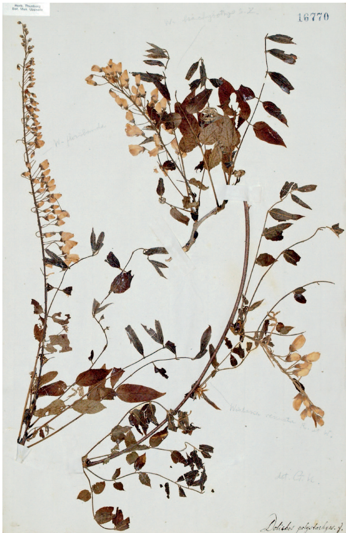
Fig. 6. Wisteria brachybotrys and W. floribunda , specimens from Japan, 1776, leg. P. Thunberg. – Uppsala, Fytoteket, THUNB-16770.