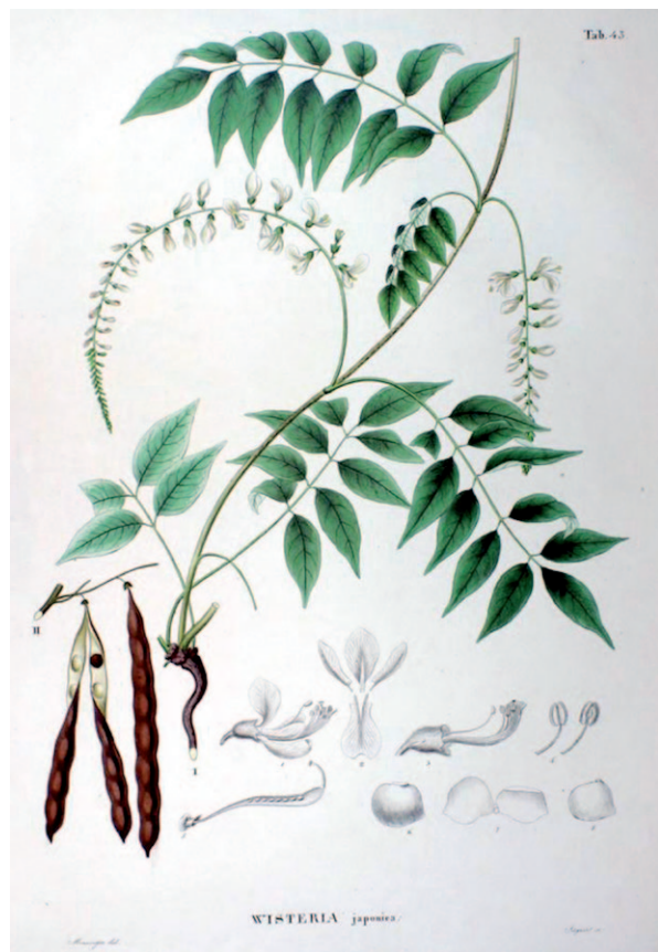
Fig. 3. Wisteria japonica , coloured lithograph by W. Siegrist based on S. Minsinger. – From Siebold & Zuccarini (1839: t. 43), London, British Library.

were highly esteemed at least since the Heian Period (794–1185) and cultivated by the Japanese for centuries (Valder 1995). Numerous cultivars have been selected and images prepared to document W. floribunda since the early phase of the Edo period (1603–1868), e.g. painted on silk scrolls and in cloisonné wares. There have even been wisteria-viewing sites in and near Kyoto and Edo [Tokyo] recorded for this period of Japanese history (Valder 1995).