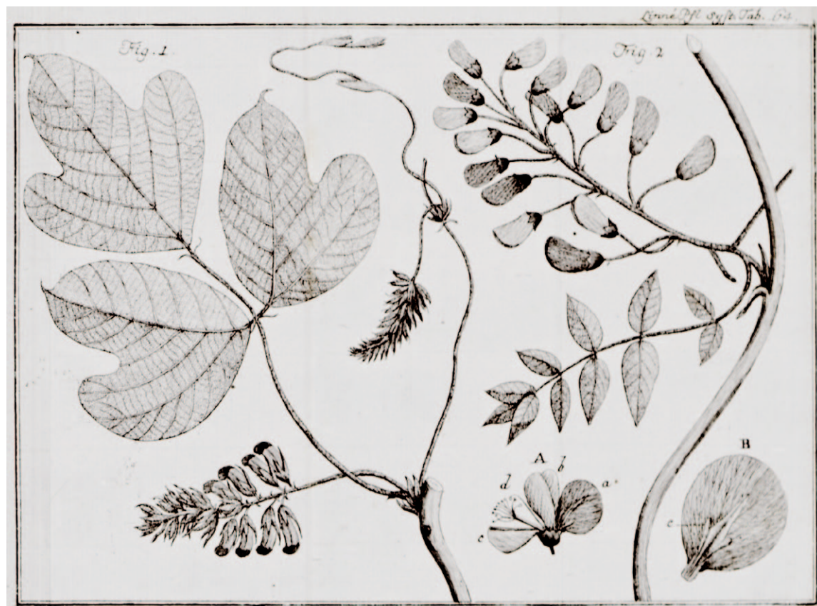
Fig. 8. Wisteria cf. brachybotrys , copper engraving. – From Panzer (1782: t. 64, fig. 2), Berlin, Freie Universität, Botanischer Garten und Botanisches Museum Berlin-Dahlem, Bibliothek.

Gronovius (1743) that he defined Dolichos polystachios L. (Linnaeus 1753). Houttuyn's reference to Gronovius is to D. polystachios in the second edition of the "Flora virginica" (Gronovius 1762). D. polystachios , known colloquially as 'Thicket Bean', is an herbaceous twining bean-like plant with small clusters of purple flowers. It is now recognised as Phaseolus polystachios (L.) Britton & al., bearing little resemblance to any species of Wisteria .