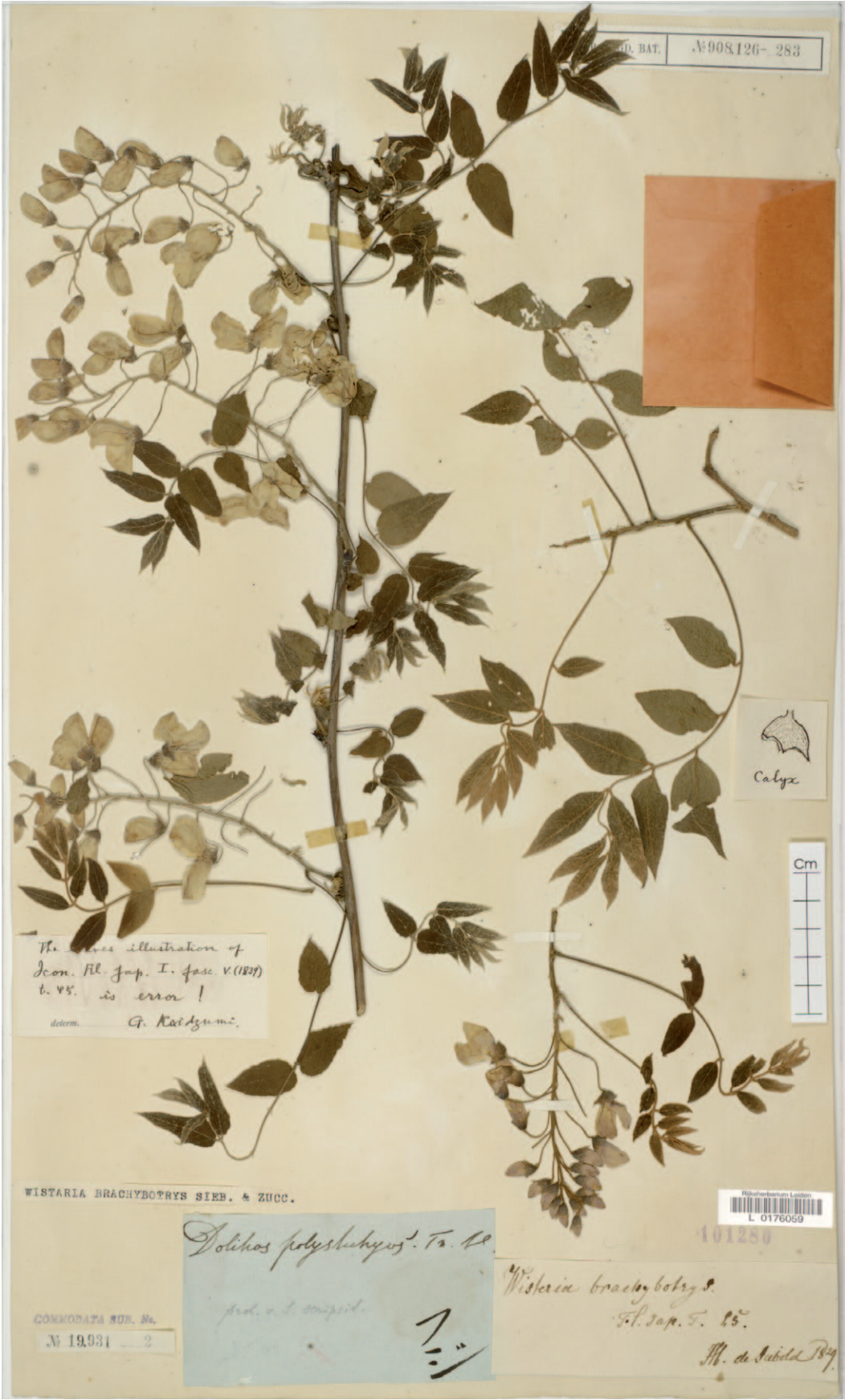
Fig 11. Lectotype of Wisteria brachybotrys , specimen from Japan, [s.l.], 1829, Herb. Siebold [Fl. Jap t. 45.], L 0176059. – Leiden, National Herbarium of The Netherlands.