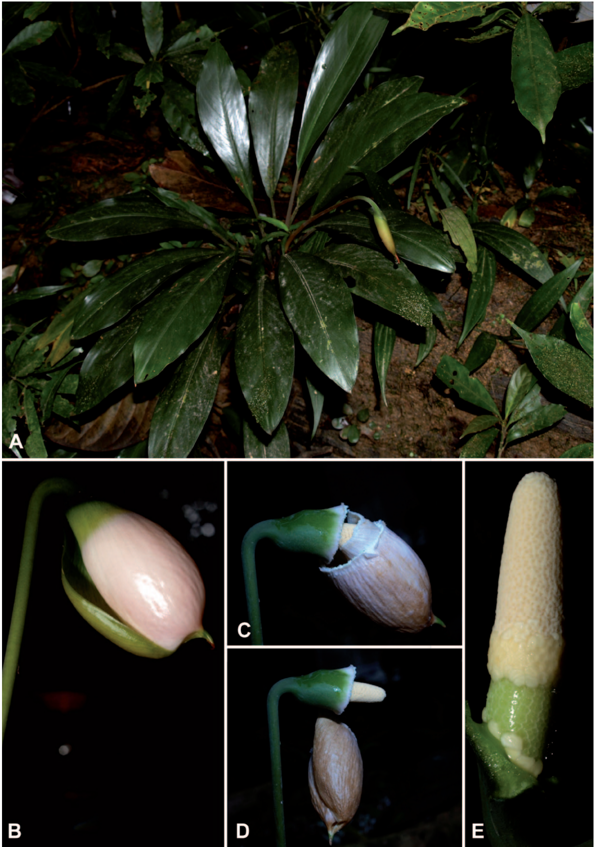
Fig. 2. Piptospatha burbridgei – A: flowering plant in habitat, on shales, Mulu N. P., N. Sarawak; B: inflorescence at pistillate anthesis; C: inflorescence at onset of staminate anthesis. Note that the spathe limb has begun to senesce and has partly separated from the lower, persistent spathe; D: inflorescence towards end of staminate anthesis; E: spadix (spathe artificially removed) at pistillate anthesis.