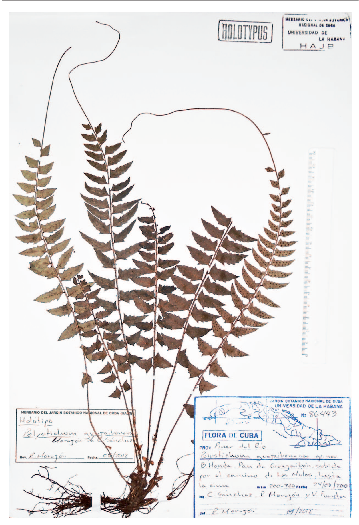
Fig. 2. Polystichum guajaibonense – holotype specimen at HAJB.