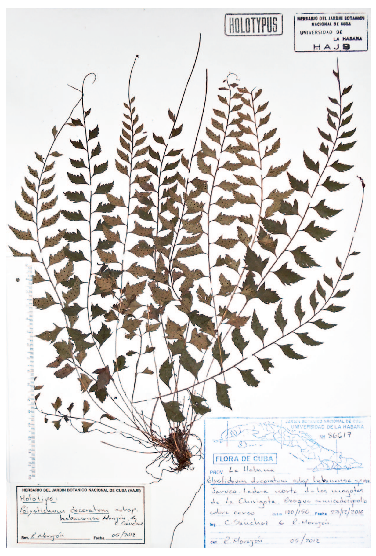
Fig. 1. Polystichum decoratum subsp. habanense – holotype specimen at HAJB.