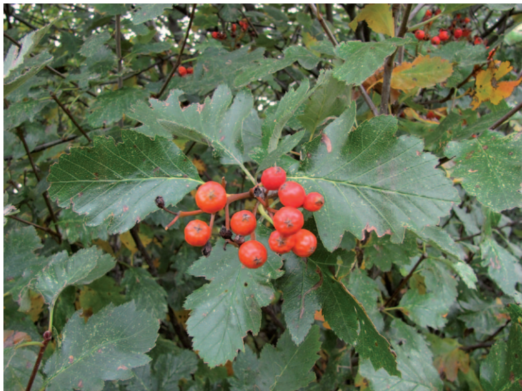
Fig. 5. Sorbus tauricola , fruiting branch showing the glossy upper side of the leaves. — Crimea, Ai-Petri Mt, 25 Sep 2010.

The Crimean whitebeams that belong to the apomictic complex of Sorbus latifolia (Lam.) Pers. s.l. were first discovered by Zelenetzky (1906), who identified them as “ S. scandica Fries”. Stankov (1927) reported the plant as S. latifolia . Popov (1959a) acknowledged the isolated occurrence of the Crimean plants and their difference from Central European whitebeams and described the Crimean populations as S. pseudolatifolia K. Popov. Popov provided an extensive description in Latin but designated two gatherings as types, one in flower and the other in fruit, making the new name not validly published under Art. 40.1. Zaikonnikova (1985) renamed the species because of homonymy but omitted the type designation, and this issue was also neglected in a recent list of Ukrainian type specimens (Fedoronchuk 2006). The name suggested by Zaikonnikova is in current use (Czerepanov 1995; Mosyakin & Fedoronchuk 1999; Zaikonnikova 2001; Yena 2012) and is validly published here. Under Art. 46.5 and 46.10 its authorship is “Zaik.