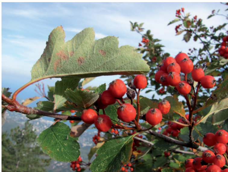
Fig. 6. Sorbus tauricola , fruiting branch showing the grey-green tomentose lower side of the leaves. — Crimea, Ai-Petri Mt, 25 Sep 2010. — Photo by P. Evseenkov.

ex Sennikov”; the name may not be attributed to Zaikonnikova alone under Art. 46.2.