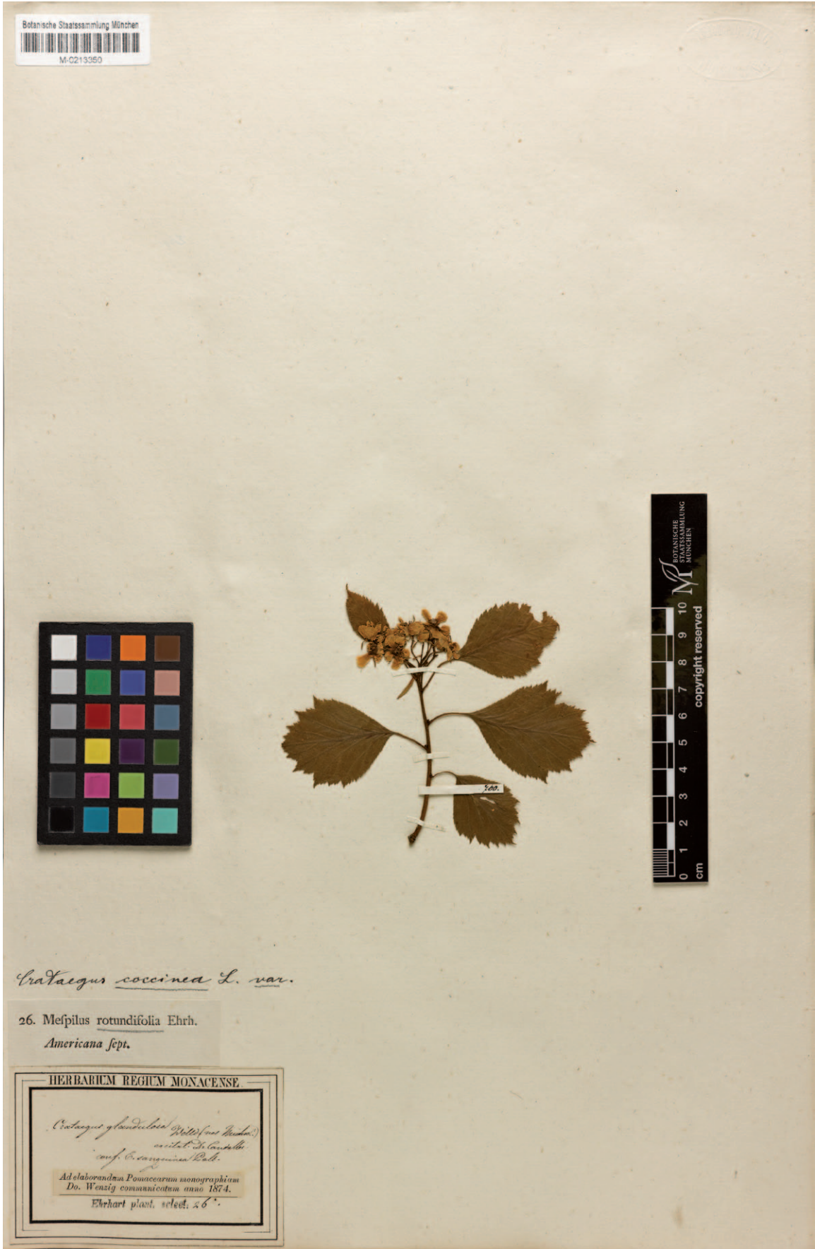
Fig. 3. Neotype of Mespilus rotundifolia – Ehrhart (1792), Plantae selectae hortuli proprii 3: No. 26 (M 0213350).