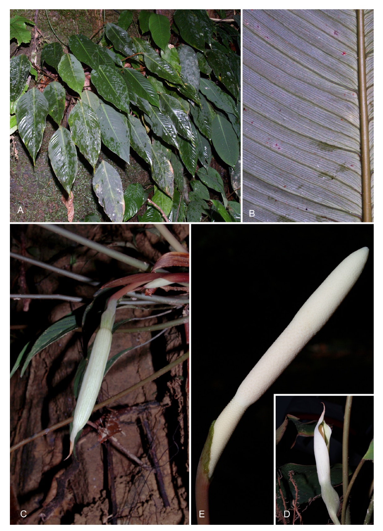
Fig. 2. Schismatoglottis mayoana – A: plants in habitat, edge of sandstone waterfall, Kubah N. P.; B: detail of abaxial surface of leaf blade, showing dense pellucid secondary venation; C: plant flowering (very early pistillate anthesis) in habitat. Note matt reddishsuffused peduncle and while spathe limb; D: inflorescence at late pistillate anthesis. Note that in nature inflorescence would be pendent; E: spadix at late pistillate anthesis, with spathe artificially removed. Note that top of pistillate zone is markedly narrower than other zones of spadix. – All from P. C. Boyce & S. Y. Wong AR-1828. – Photographs by Peter C. Boyce.