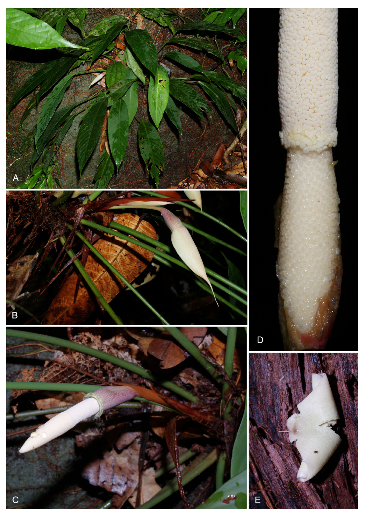
Fig. 3. Schismatoglottis nicolsonii – A: plants in habitat, edge of sandstone waterfall, Bako N. P.; B: flowering plant in habitat; C: inflorescence at onset of staminate anthesis, with spathe limb shed; D: detail of pistillate zone and lower part of staminate zone. Note that staminate zone is fertile to base; E: spathe limb shed during onset of staminate anthesis. – All from P. C. Boyce & al. AR- 2106.