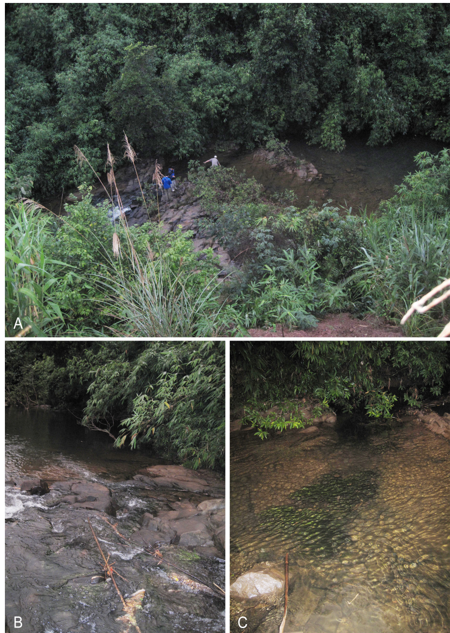
Fig. 1. Cryptocoryne crispata var. tonkinensis – A: habitat showing stream running in granite bedrock in gully; B: descent to water shown in A; C: pool with large patch of submerged plants. – Vietnam, Quang Ninh Province, W of Hai Ha, Cau Khe Heo, 130 m, 15 Dec 2013, photographs by M. Ørgaard.

Several people have dealt with the identity of var. tonkinensis over the years. Mühlberg & Hertel (2007) dealt with all the classical collections from Vietnam in a detailed morphological, phenological and nomenclatural study.