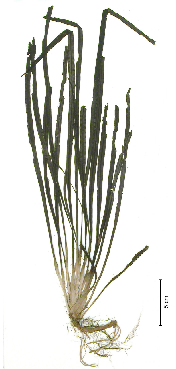
Fig. 3. Cryptocoryne crispata var. tonkinensis – China, Guangxi Province, tributary of Beilun River near village of Na Liang, H. Zhou 05-04-3 (L).

Zhou & al. (2010) also found another form of Cryptocoryne crispata with long narrow undulate-crispate leaves occurring in a small stream north of Dongxing, also in Guangxi Province, which was then also referred to var. flaccidifolia . Based on our present observations we would now also refer this gathering to var. tonkinensis (Na Suo River, 30 Jan 2010, H. Zhou ZH2010-2 [= B 1353],