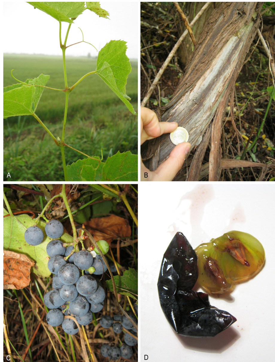
Fig. 4. Vitis x novae-angliae additional morphological traits – A: continuous tendrils; B: stem and exfoliating bark; C: infructescence and pedicels with characteristic residuals of red mesocarp after detachment of berries; D: berry with mucilaginous mesocarp clearly separating from exocarp. – A, C, D: Albuzzano, Italy; B: Bereguardo (Moriano), Italy. – Photographs by N. M. G. Ardenghi.

According to Moore (1991), the native range of Vitis x novae-angliae comprises the states of New England (NE United States), where it was described by Fernald (1917). However, its occurrence in further sites where the ranges of V. labrusca and V. riparia overlap is possible, as