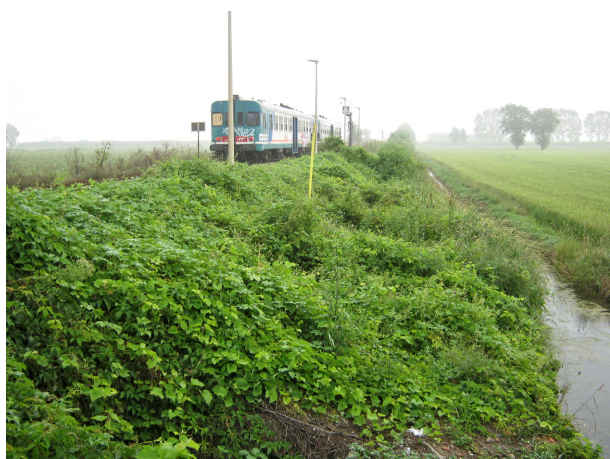
Fig. 5. Vitis xnovae-angliae naturalized population in Albuzzano, Italy, covering railway ballast.

with V. aestivalis and with both V. aestivalis and V. riparia were also mentioned, whose occurrence in the wild is quite doubtful, due to their difficult reproduction from cuttings and their susceptibility to phylloxera and downy mildew, deficiencies which soon caused their rejection from French viticulture, see Galet 1988). In Italy, V. xnovae-angliae is currently known from the N part of the Po Plain from Lombardia to Veneto, which corresponds, along with the NE part of Emilia-Romagna, to the traditional and most important cultivation area of ‘Clinton’ in the country (Rossi 1920; Istituto centrale di statistica del Regno d’Italia 1937; Istituto centrale di statistica & Ministero dell’agricoltura e delle foreste 1973, 1974). The presence of V. xnovae-angliae is expected in further European countries (e.g. Austria, Hungary, Romania, Switzerland, former Yugoslavia), where the cultivation of labrusca-riparia hybrids is reported (Galet 1988; Ufficio federale dell’agricoltura UFAG 2014+).