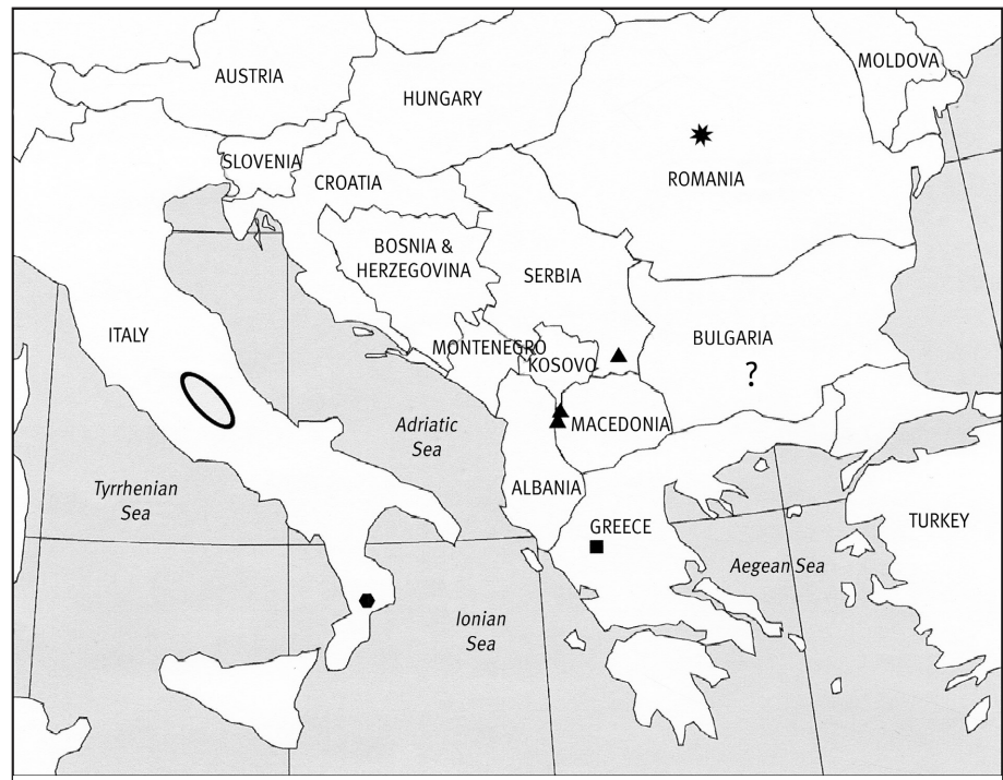
Fig. 4. Distribution of the Ranunculus auricomus complex in SE Europe: ■ = R. pindicola ; ○ = R. marsicus ; ▲ = R. degenii ; ● = R. silanus ; ★ = R. pseudobinatus .

Reported localities in the literature — Greece, Pinde, bord des eaux: pozzines de Metzovon, vers 1700 m (Quézel & Contandriopoulos 1965); in scaturiginosis jugi subalpini Zygos P. T. [Pindus Tymphanos = Katara pass] (Haussknecht 1898).