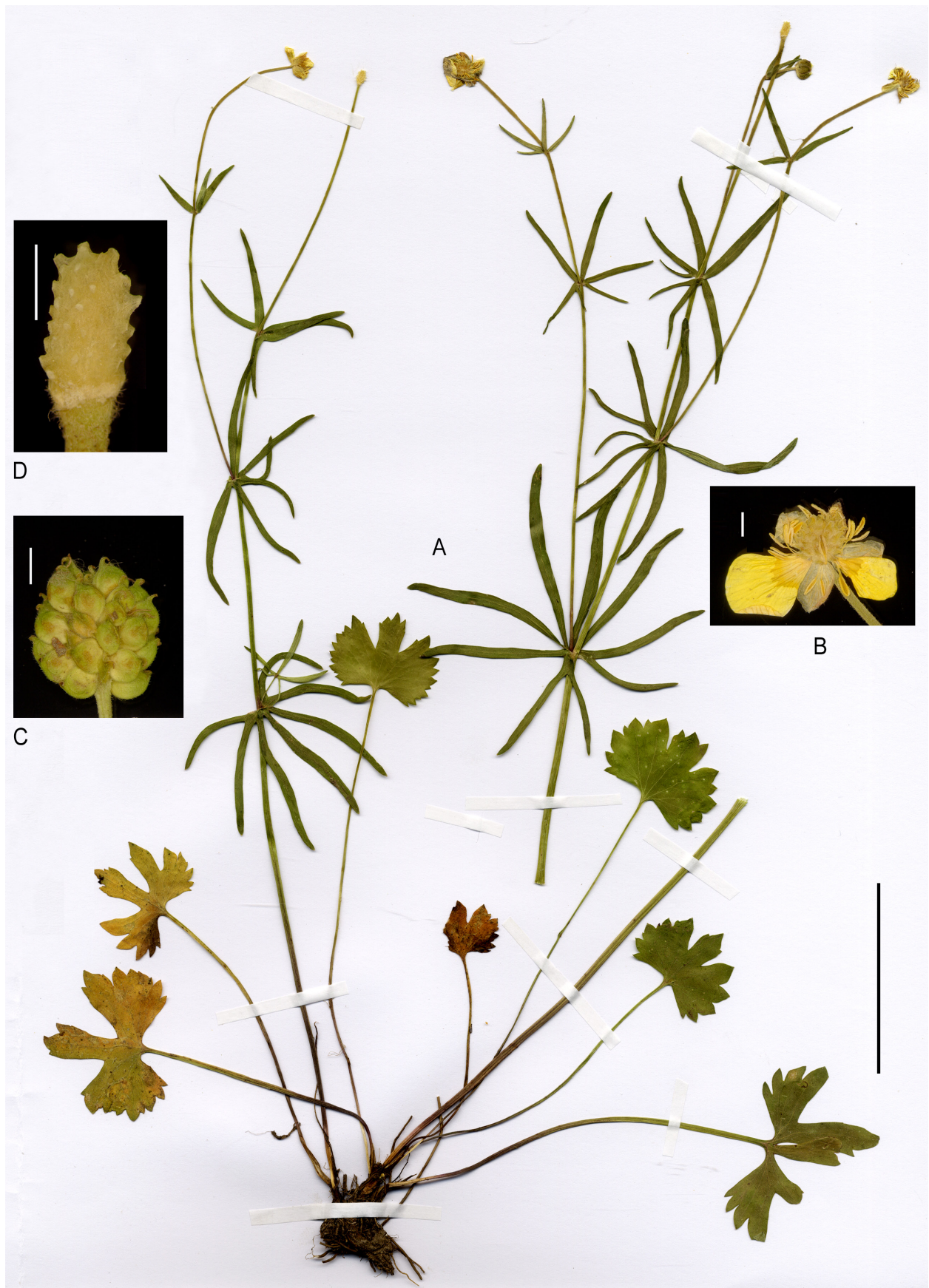
Fig. 1. Ranunculus pindicola – A: holotype; B: flower (from Du-26720-7); C: fruit (from Du-26720-7); D: receptacle (from holotype). – Scale bars: A: 5 cm; B, C, D: 2 mm.