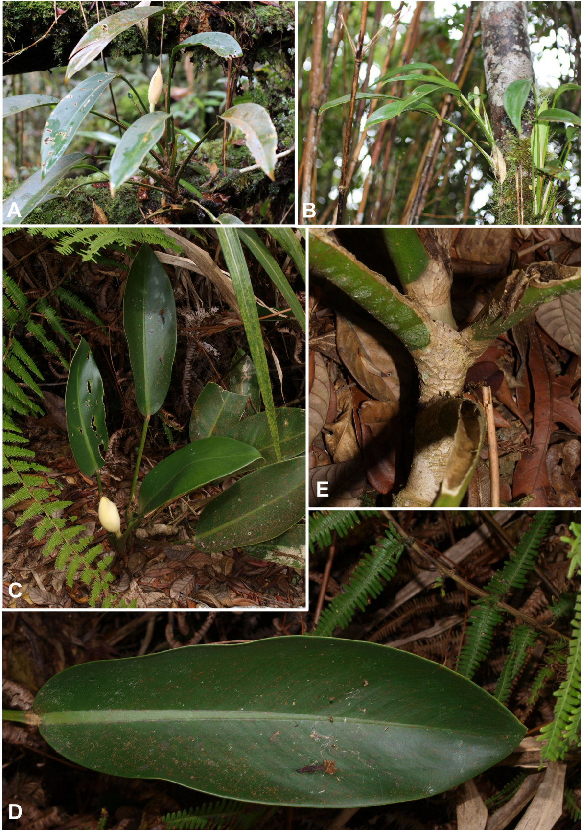
Fig. 1. Scindapsus kinabaluensis – A & B: flowering (A) and early fruiting (B) climbing plants in habitat; C: terrestrial plant flowering in habitat; D: leaf blade, adaxial view; E: detail of ageing portion of stem; note the corky, cracking epidermis. – A & B from Kartini BORH 2213; C–E from Wong Sin Yeng & P. C. Boyce AR-4738.