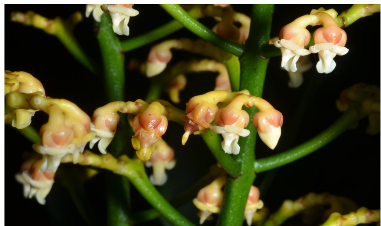
Fig. 5. Rinorea gabonensis with four petals reflexed and anterior petal erect. — Photographed by Ehoarn Bidault in Gabon from Bidault 784.