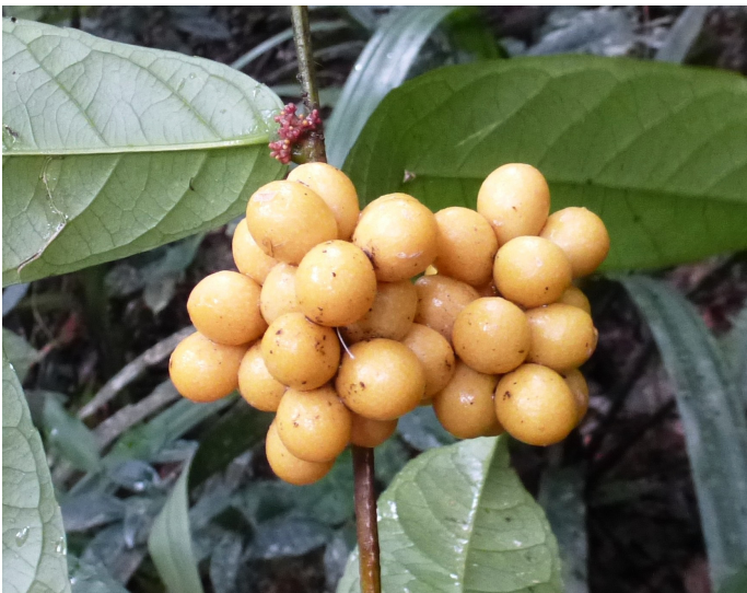
Fig. 1. Decorsella paradoxa showing berry-like seeds from two fruits. – Photographed by Carel Jongkind in Liberia from Jongkind & al. 11998.

Decorsella arborea Jongkind, sp. nov. – Fig. 2A–N. Holotype: Gabon, Ngounié, Missionary Station at Mouya-