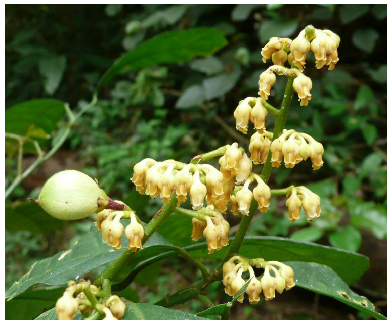
Fig. 4. Rinorea longicuspis showing zygomorphic flowers with longest (anterior) petal ending straight and flat. — Photographed by Carel Jongkind in Liberia from Jongkind & al. 9192.