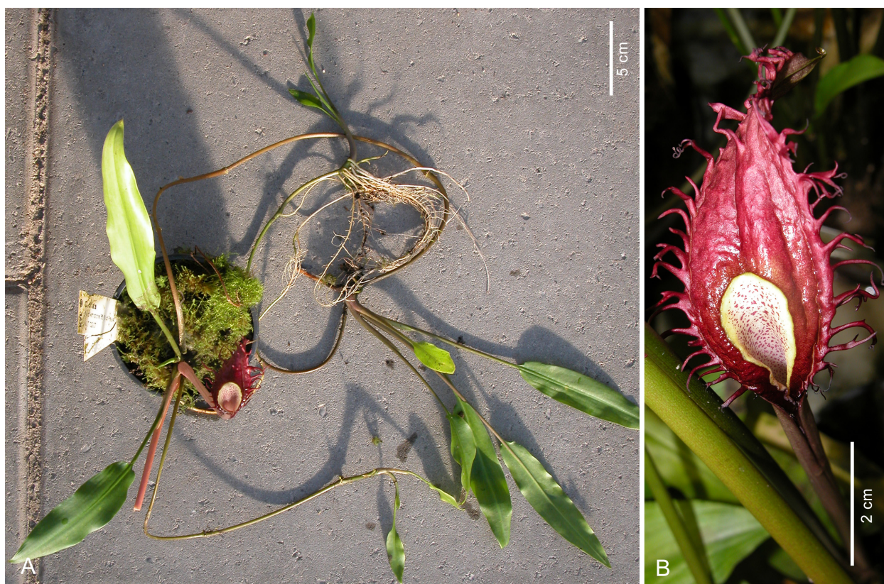
Fig. 1. Cryptocoryne ciliata var. ciliata – A: flowering plant in cultivation showing long, rooting stolons; B: spathe limb with a distinct, red-spotted tube opening. – Source: S Thailand, Tha Pom Klong Song Nam, 21 Dec 2003, NJT 03-15A .

(Bastmeijer 2018; Ipor & al. 2009; Jacobsen 1985; Jacobsen & al. 2012; Othman & al. 2009).