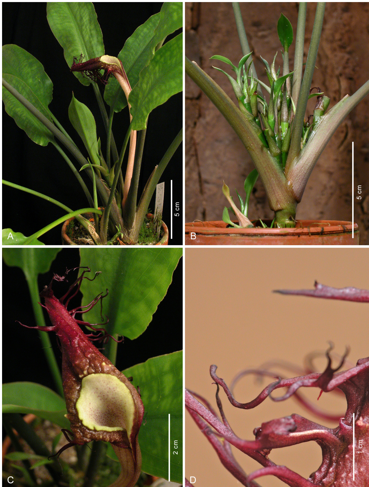
Fig. 2. Cryptocoryne ciliata var. latifolia – A: flowering plant in cultivation showing a few vertical, short, fragile stolons; B: base of plant with numerous vertical, short, fragile stolons; C: spathe limb with a faintly red-spotted tube opening; D: ± branched cilia along margin of spathe limb. – Source: Thailand, Bangkok, 24 Feb 2002, NJT 02-27.