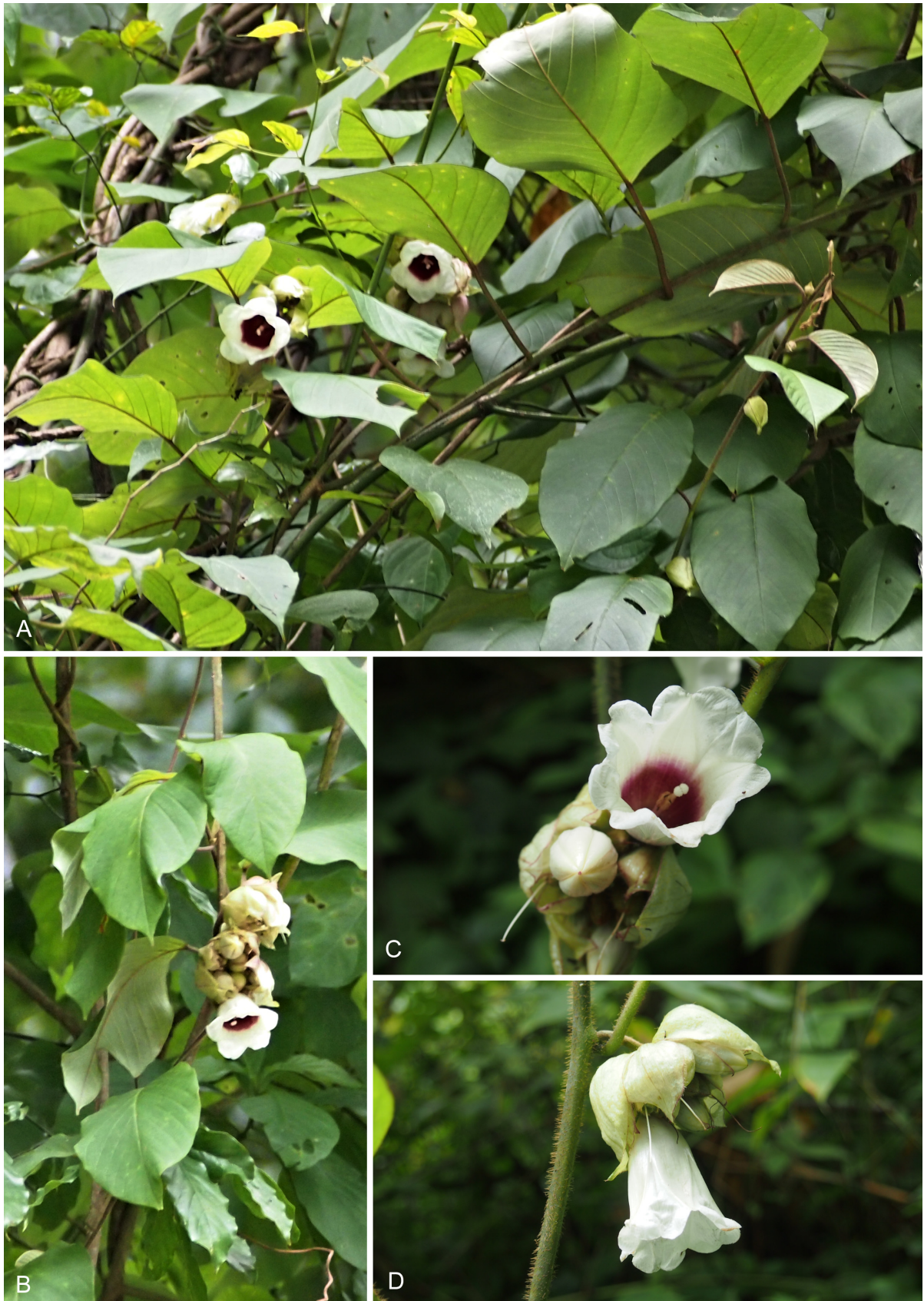
Fig. 2. Argyreia decemloba inflorescence and corolla details – A, B: plant habit (voucher: Fujikawa & al. 95008); C: flower in frontal view, showing 10-lobed corolla limb, included genitalia, and reddish interior of corolla tube; D: inflorescence and flower in lateral view, showing capitate inflorescence with short, thick peduncle, overlapping whitish bracts, and triangular-funnelform corolla shape (voucher: Fujikawa & al. 94296).