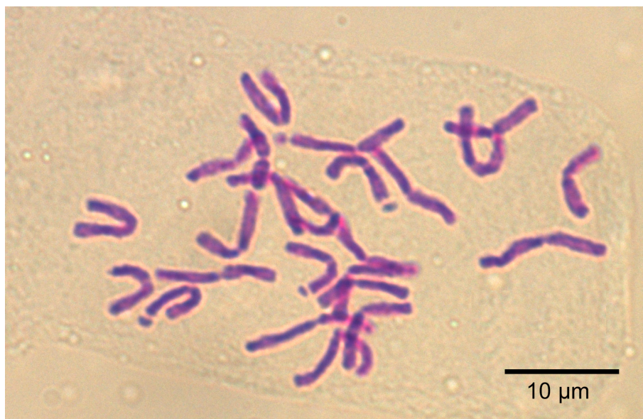
Fig. 3. Metaphase plate of Allium oreohellenicum from the type locality, 2n = 3x = 24 .

There is no doubt that in high-altitude habitats of the mountains of N Peloponnisos one more taxon of the Allium paniculatum group is present, sometimes growing side by side with A. frigidum . It is characterized by having outer bulb tunics often longitudinally splitting into parallel fibres, inflorescence erect (versus pendulous in A. frigidum ), spathe valves longer than the pedicels, perianth segments pinkish white in the living state, to 6(–6.5) mm long, stamens with white-yellowish anthers included in the perianth, and ovary much longer than wide, narrowed at the base and truncate at the apex (Fig. 1A, 2A & 4). Plants with a similar morphology have also been collected in the high mountains of Sterea Ellas and in the Pindos range of NW Greece (Thessalia/Ipiros) and were treated by Tzanoudakis & Vosa (1988)