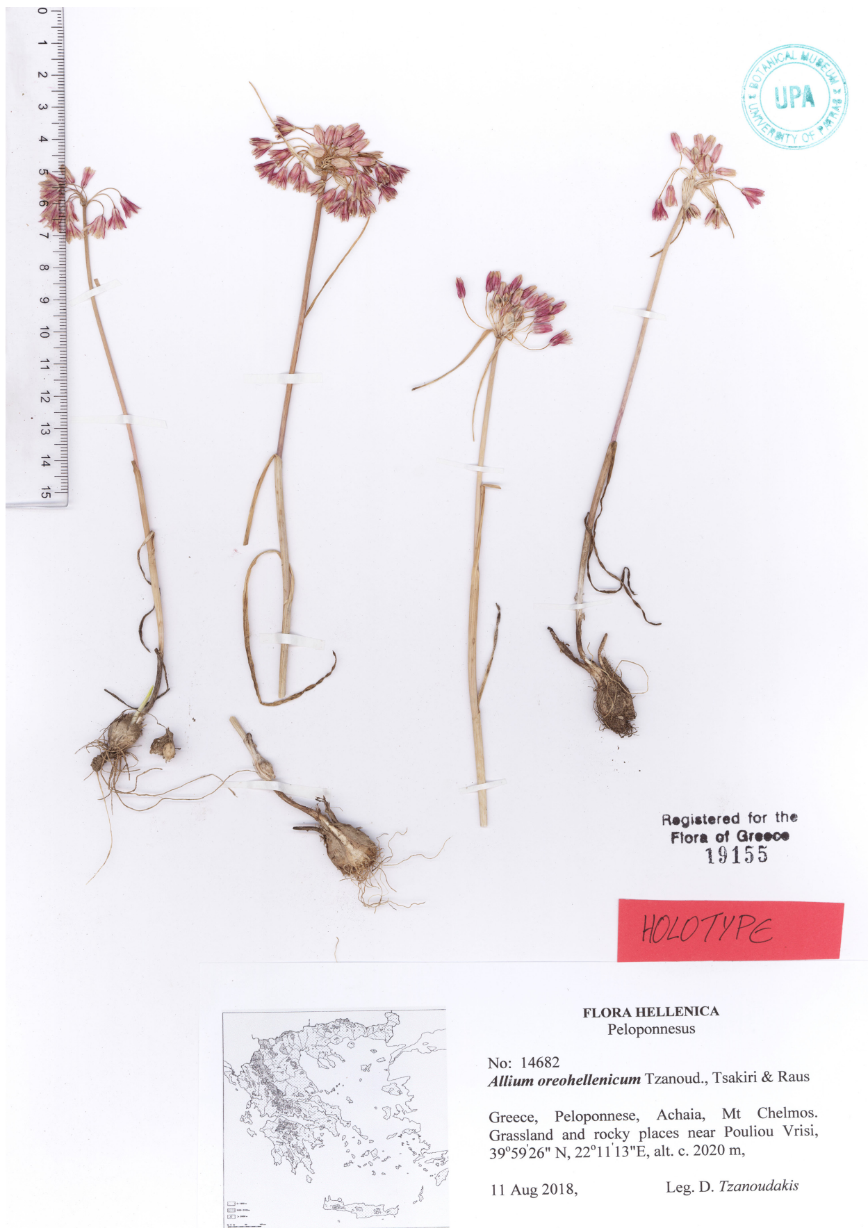
Fig. 4. Holotype of Allium oreohellenicum Tzanoud., Tsakiri & Raus, Tzanoudakis 14682 (UPA).