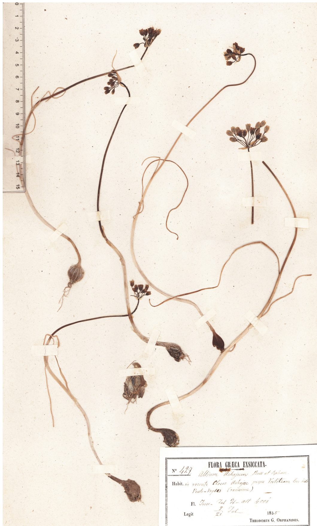
Fig. 5. Isotype of Allium achaium Boiss. & Orph. (in UPA), from the original gathering made by Orphanides in 1855 on Mt Klokos (Achaia, Peloponnisos, Greece). It belongs taxonomically to A. frigidum Boiss. & Heldr. Note the pendulous inflorescences.