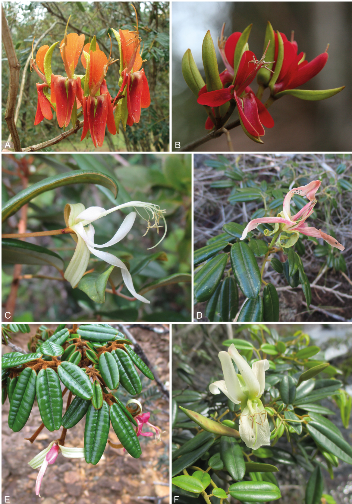
Fig. 1. Flowers of some Cuban species of Harpalyce. – A: H. macrocarpa, cultivated in the Botanical Garden of Villa Clara, Feb 2014; B: H. suberosa, cultivated in the National Botanical Garden of Cuba in La Habana, Feb–Mar 2012; C: H. ekmanii, Prov. Holguín, Moa, Cayoguan, Nov 2020; D: H. acunae (old flower), Prov. Holguín, Mayarí, Sierra de Nipe, Jan 2020; E: H. villosa, Prov. Holguín, Moa, El Toldo, Apr 2015; F: H. nipensis, Prov. Holguín, Sierra de Nipe, Aug 2020.