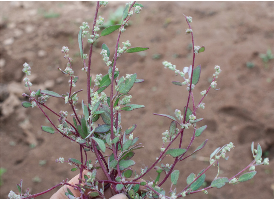
Fig. 2. Chenopodium hoggarens , flowering and fruiting branches. – Algeria, rocky plateau of Assekrem, 2700 m, 24 Oct 2019, photograph by S. Benhouhou.

pericarp fairly thin, quite easily scraped off. Seeds lenticular with weakly acute margin, 1.2–1.3 × 1.1–1.2 mm, 0.4–0.5 mm thick, testa finely radially rugose to almost smooth.