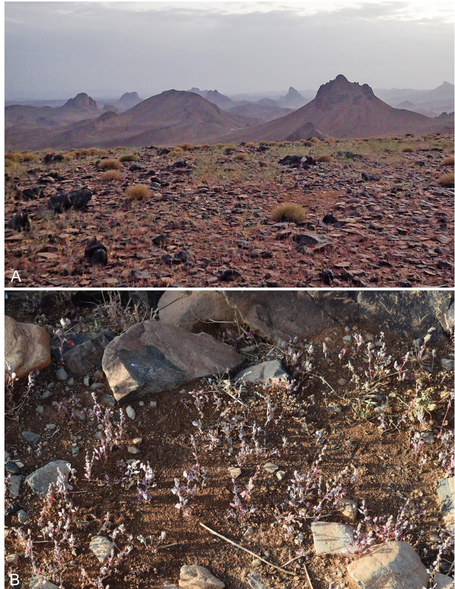
Fig. 5. A: Algeria, rocky plateau of Assekrem, 2700 m, view to south, 24 Oct 2019; B: same locality, habitat of Chenopodium hoggarens , 24 Oct 2019.

Because there are some doubts about the identity of Chenopodium vulvaria var. incisum , its position is left open here.