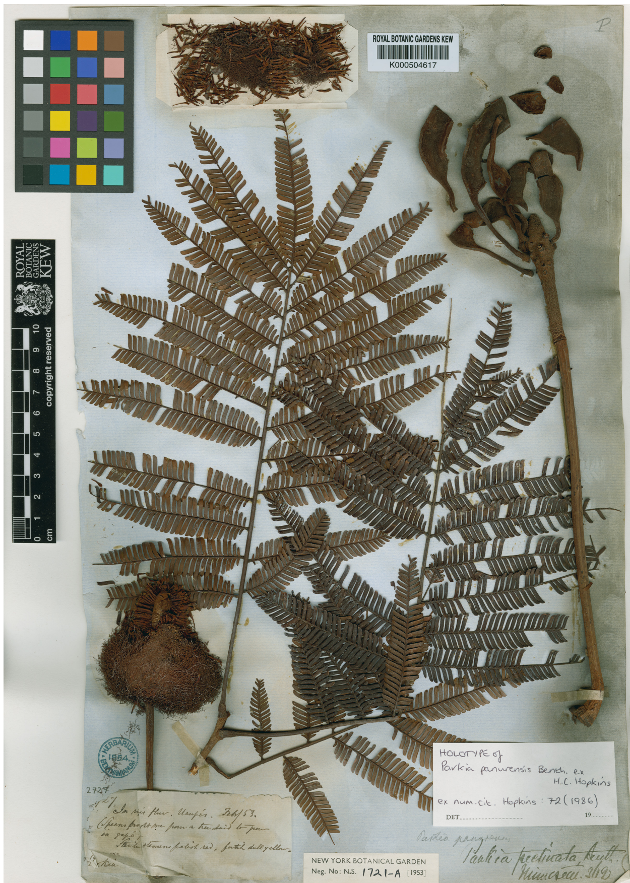
Fig. 3. Holotype of Parkia panurensis, Spruce 2727, from Rio Uaupés, Brazil (K000504617).