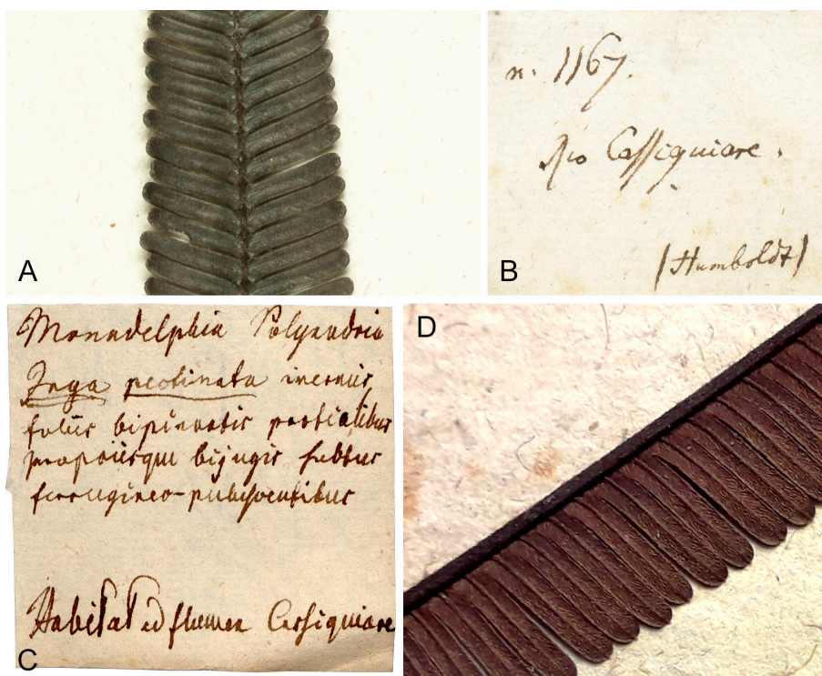
Fig. 2. Details enlarged from Fig. 1. – A: adaxial surface of leaflets; B: notes attached to specimen; C: notes on a separate sheet in the same folder (B -W 19056 -00 0); D: leaflets from P00679369, abaxial surface showing ferruginous indumentum.

All material cited has been seen either in the herbarium (BM, F, INPA, K, MO, NY, P, RB, US) and/or as an image online, unless marked “n.v.” (not seen), and the barcode, QR-code (U) or accession number (VEN) is given, when known, in the section on Taxonomy and in Appendix 1. Images were seen online via GBIF (2024+), Herbario Virtual Austral Americano (2024+, also accessed as the Neotropical Plant Portal 2024+), JACQ (2023+), JSTOR Global Plants (2000–2024), Reflora Virtual Herbarium (2024+), speciesLink (2024+), as well as through the virtual herbaria of some individual institutions, including B (Herbarium Berolinense 2000+) and U (Naturalis Bioportal 2024+), or sent to us in response to specific requests (HBG, MO, NY, PORT, VEN). For types only, we distinguish between sheets seen in the herbarium and those seen