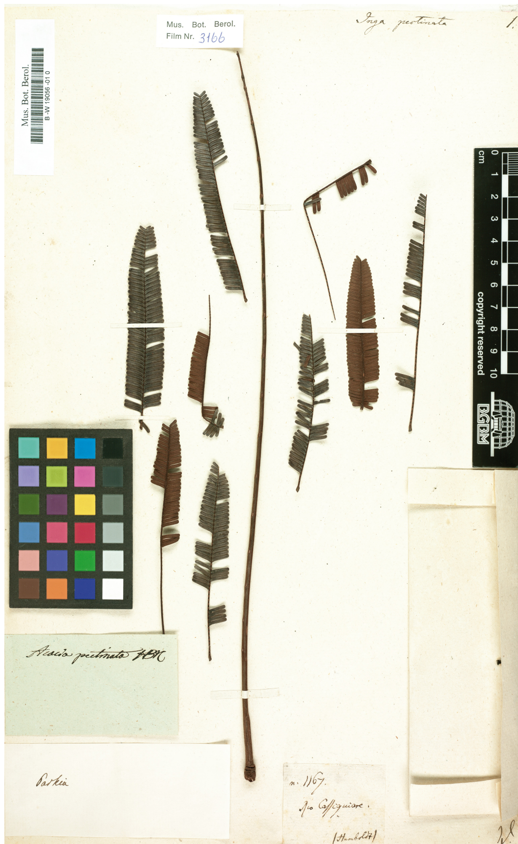
Fig. 1. Type material of Inga pectinata, Bonpland & Humboldt 1167 from the Río Casiquiare, Venezuela (B-W 19056-01 0).