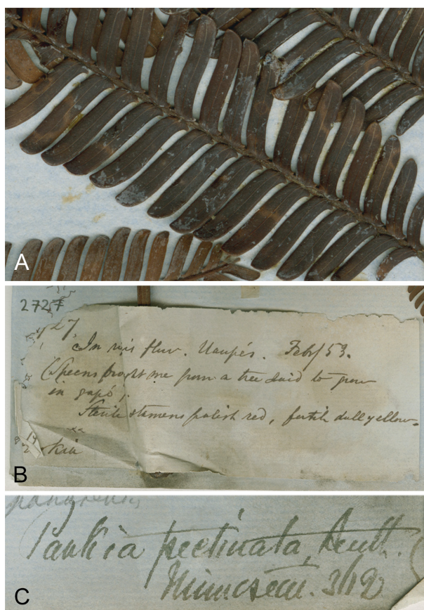
Fig. 4. Details enlarged from Fig. 3. – A: enlargement of leaflets, adaxial surface; B: notes attached to specimen; C: Benthams erroneous identification as P. pectinata , probably written by D. Oliver. – Images supplied by the Royal Botanic Gardens, Kew, and copyright of the Trustees.

Benthams (1875: 362, 662) treated Parkia pectinata as species number 13 in this genus under P. sect. Paryphosphaera Benth., providing a brief description, and the name was listed in the index to species; there is no key to species in this work. He did not cite any specimens for P. pectinata but mentioned characters of the peduncles, fruits and leaves, stating that the leaflets were sub-sigmoid-falcate; indumentum was not mentioned. Because Bonpland & Humboldt 1167 is sterile, the fruit and peduncle characters must have been taken from a different collection, and presumably the peduncle and receptacle